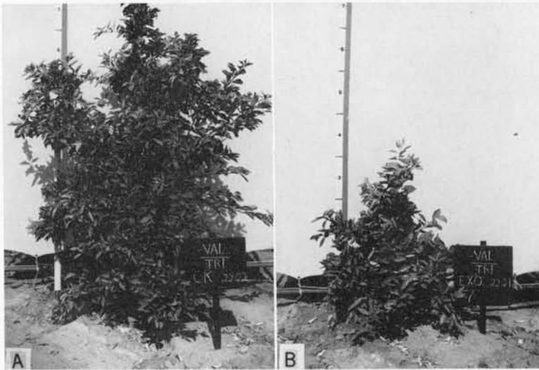
FIGURE 1. A. Noninoculated control tree of Valencia orange/Trifoliolate orange. B. Inoculated tree of same combination stunted by exocortis virus. Photographed 30 months after planting.

STUNTING.—Stunting was sometimes observed in inoculated indicator trees before external symptoms developed but sometimes could not be detected until bark symptoms were well developed. Most of the inoculated trees became stunted 1½ to 5 years after inoculation. The degree of stunting of trunks may be judged by consideration of the data in Table 1. Stunting of tops having exocortis-indicator rootstocks (Fig. 1) usually was more severe than indicated by cross-section areas of trunks.