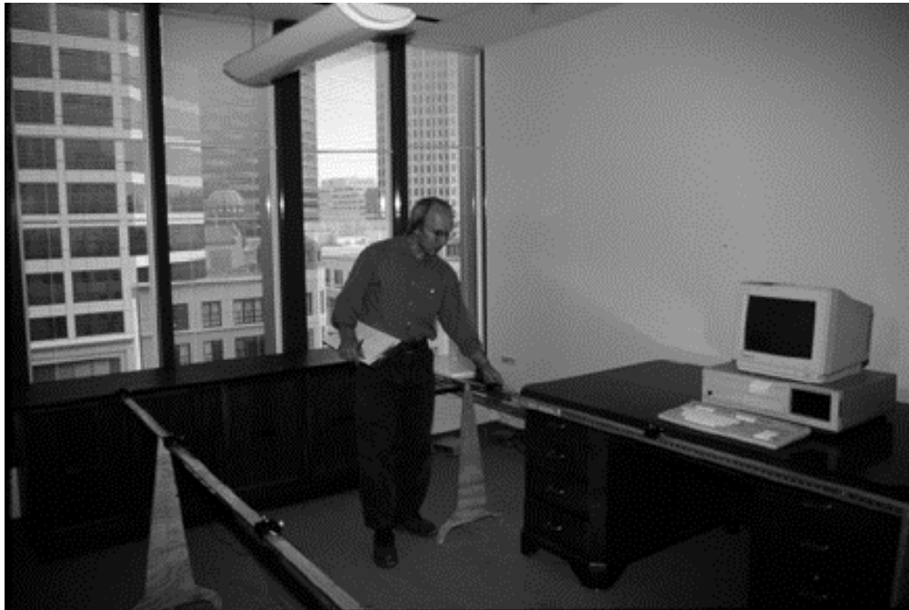
Figure 1. Interior view of the full-scale testbed office in Oakland, California.

blinds present a more difficult control problem because of the added complexity of the interreflectance of the slats. Dynamic blind systems have been evaluated in two side-by-side test rooms in a large office building in Oakland, California (Figure 1). The "rooms within a room" are set up as typical offices and are also instrumented to measure cooling and lighting loads. The integrated control system worked very well, with the blind controls set to prevent direct sun penetration, permit view out when available, and actively manage incident daylight to provide 500 lux on the workplane whenever possible, topping off with electric light when needed. Sample performance over two typical days is shown in Figures 2 and 3. Energy and illuminance data have been collected for over a year and initial occupant response studies have been completed. Lighting energy savings range from 35% in winter to 40-50% in summer, when compared to a similar static blind system. If compared to a non-daylighted space, lighting energy savings ranged from 22%-86%. Summer daily cooling load reductions measured 5-25%; peak cooling load reductions were even larger. We are now testing a different type of blind that raise and lower as well as tilting slats. This provides higher interior illuminances under overcast conditions and better view.