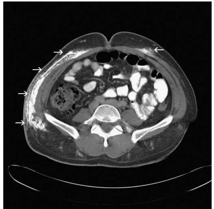
Figure 2. Sagittal view of computed tomography showing right-sided calcification as well as small calcific foci on left anterior abdomen.

Laboratory tests to support the diagnosis of dermatomyositis include serum muscle enzyme concentrations as well as autoantibody tests. Often, CK, LDH, aldolase, and aminotransferases are elevated from muscle breakdown. Patients usually have autoantibodies ranging from nonspecific