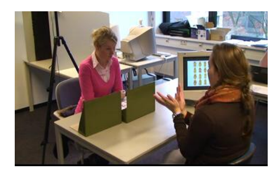
Figure 3. Setup of the experiment, matcher sits on the left and director sits on the right.

The experiment was performed in a lab, where the director and the matcher were seated at a table opposite each other (see Figure 3 for the setup).