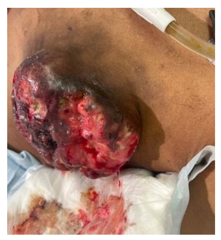
Figure 1 . Overlying the left breast is a 14cm×12cm ulcerated, fungating tumor.

On physical examination, there was a 14cm×12cm ulcerated, fungating tumor occupying the entirety of the left breast ( Figure 1 ). Computerized tomography imaging showed multiple spinal lytic bone lesions, innumerable pulmonary nodules, and lymphadenopathy concerning for metastatic disease.