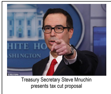
Treasury Secretary Steve Mnuchin presents tax cut proposal

Republicans control the White House, and both the House and Congress. Having failed on health care, and produced no major piece of legislation, Trump and congressional Republicans have turned their attention to tax cuts as their political salvation.