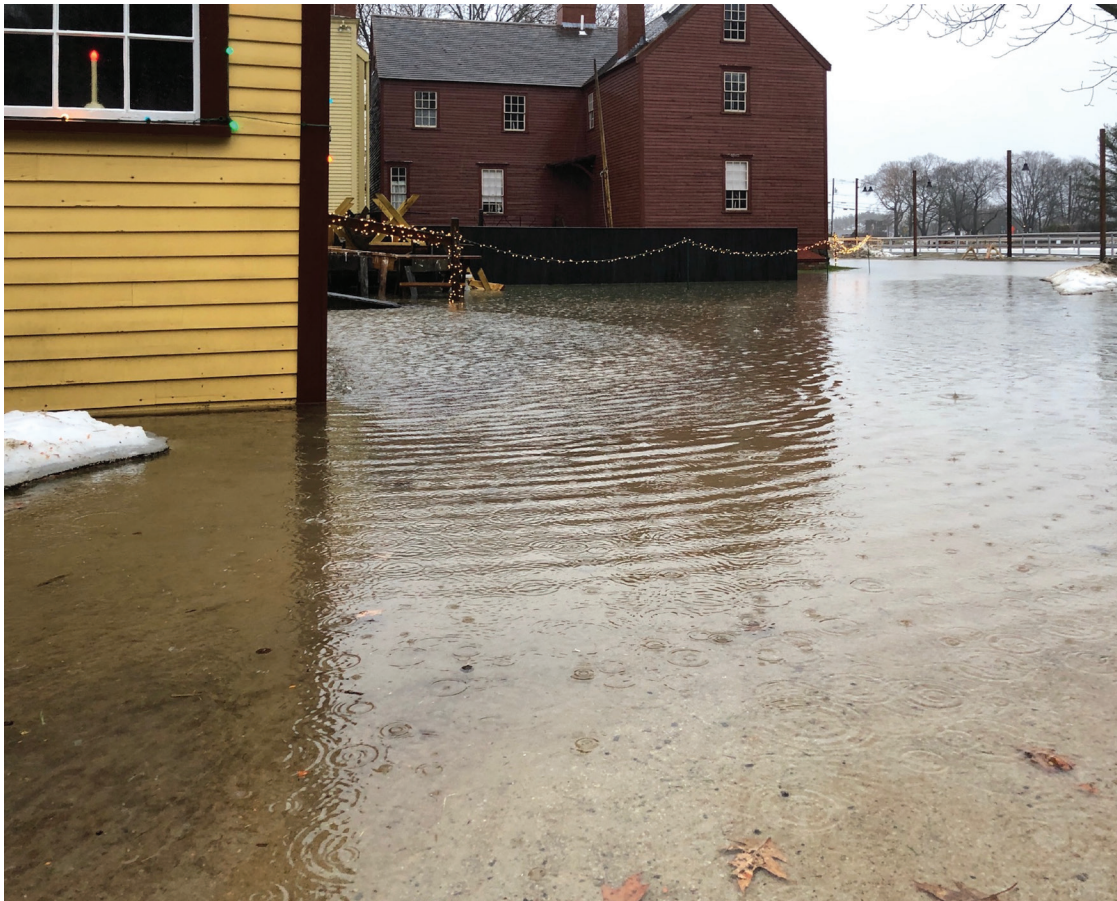
Infill flooding during high tide at the Strawberry Banke Museum in Portsmouth, New Hampshire.

The work continues in community settings as well. In New Hampshire, Strawberry Banke Museum has worked with the city of Portsmouth since 2013 to determine how sea level rise will impact the city and prepare for the consequences. In 2021, the exhibit Water Has a Memory: Preserving Strawberry Banke & Portsmouth from Sea Level Rise opened to the public to share how the city and museum are working together on mitigation strategies. In Washington, DC, the Smithsonian’s Anacostia Community Museum has created Urban Waterways , a research and educational initiative that examines the relationship between the District of Columbia and the Anacostia River. The Anacostia River watershed serves over 1 million people in the District of Columbia and parts of Maryland, but few see the landscape as a watershed. This is changing because of physical projects like a stormwater management construction and raised bed vegetable gardens that are part of public programming, and virtual projects such as a story telling of the Anacostia’s resilience .