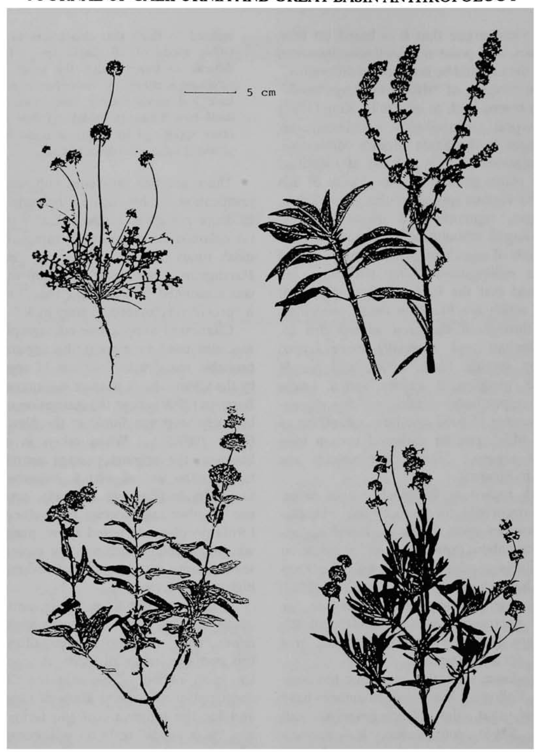
Fig. 2. Salvia species that yield edible seeds and possibly were used by the Chumash, according to King (1967). Upper left, chia (Salvia columbariae); upper right, white sage (Salvia apiana); lower left, purple sage (Salvia leucophylla); lower right, black sage (Salvia mellifera).