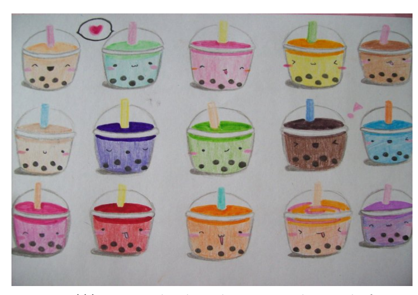
Figure 3. Bubble Tea <3 Colored pencil on paper. A photograph of an illustration created by author in 9^{th} grade and posted on Facebook on April 10, 2009.

drawings on Facebook and tagged my friends as their favorite colorful confection ( Figure 3 ). While on the Pioneer High School badminton team, teammates would drive to Tapioca Express to pick up boba before games. When my younger sister joined the badminton team, she and our friend sold homemade boba drinks and Asian snacks like Hi-Chew candies on the sidelines to