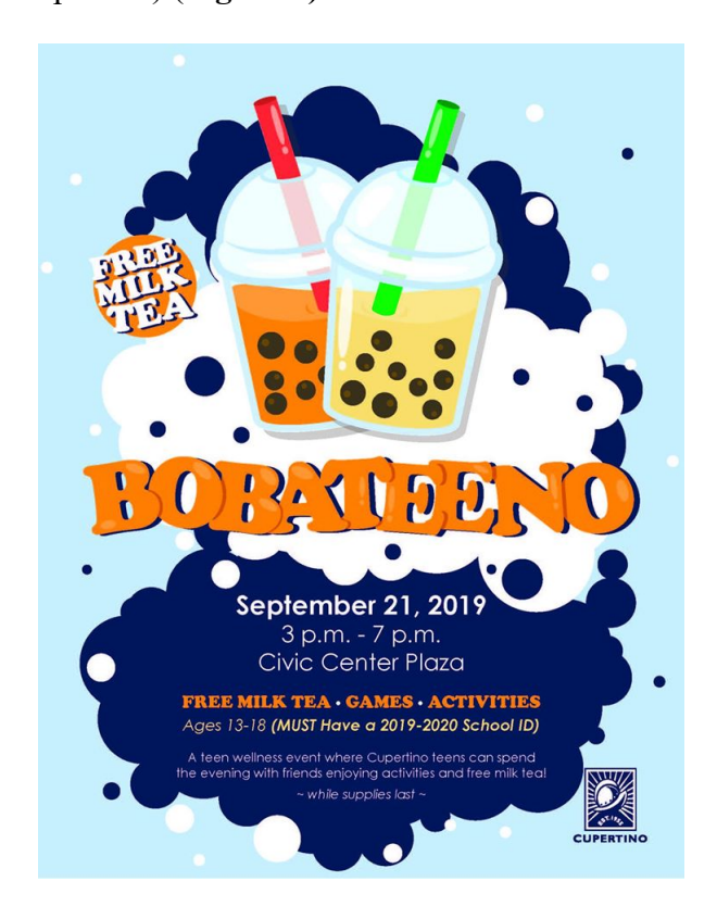
Figure 6. Posted on the City of Cupertino – City Hall Facebook Page with a caption reading "Teens! Do you enjoy free milk tea?! Silly question – of course you do. Who doesn't? Join the City of Cupertino, the Cupertino Teen Commission, and Cupertino's Youth Activity Board for Bobateeno ("City of Cupertino – City Hall" on Facebook 2020).

Cupertino's youth scene that the Cupertino City Hall hosts events such as "Bobateeno" (a play on the words Boba and Cupertino) ( Figure 6 ).