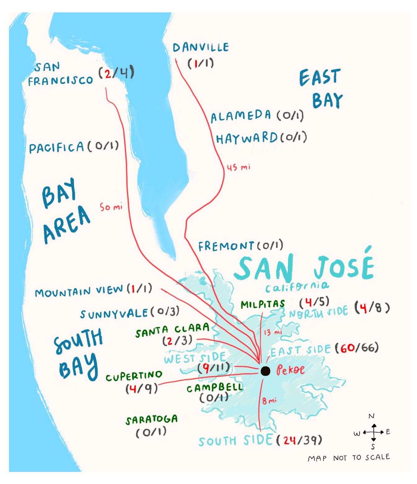
Figure 7. "Do You Know the Way to San José?": Mapping Asian American Youth Travelling to Pekoe Tea Bar Illustrated by author using Procreate and based on Google Maps. Red lines chart paths between the city identified as survey respondents' hometowns to Pekoe. The number in red indicates how many survey participants from each locality [nearby city or region of San José (West side, East side, South side, North side)] has visited Pekoe Tea Bar.