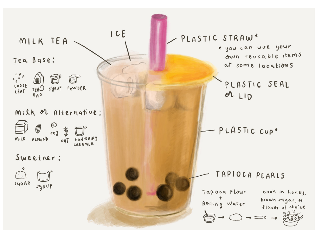
Figure 1. Anatomy of a Boba Drawn by author. Boba (n.) 1) Tea drink, 2) Tapioca pearls. Yes, it can be confusing. In my thesis, I use the term "boba" to refer to the drink in its entirety (tea + topping).

in Japan) or Hanlin Tea Room in Southern Taiwan, among others, deserves credit for its invention (Tang 2014; Zhang 2019). "Boba," also known as "Pearl Milk Tea," "Bubble Tea," "Tapioca Tea," "zhenzhu naicha (珍珠奶茶)," and "sago" among its multilingual nicknames, is a beverage consisting of the following five core ingredients: tea (with or without milk, and/or a non-dairy milk substitute), ice, sweetener, a topping (often tapioca pearls), and flavoring (natural ingredients, syrups, or powders) (Nguyen-Okwu 2019; Boba Made 2019; Chau and Chen 2019; Chau and Chen 2020) (Figure 1). Boba are round, squishy black balls made from cassava, a tropical tree starch (Chau and Chen 2019). These balls or "pearls" possess the "QQ" texture or unique "bouncy chewiness" prevalent in many Asian desserts (Nguyen-Okwu 2019; Zhang 2019). In Taiwanese, "boba" is a derogatory term for "a woman with large breasts" but has since been repurposed by Asian American youth to refer to tapioca pearls or the tea beverage in its entirety (Wei 2017; Harris 2020).