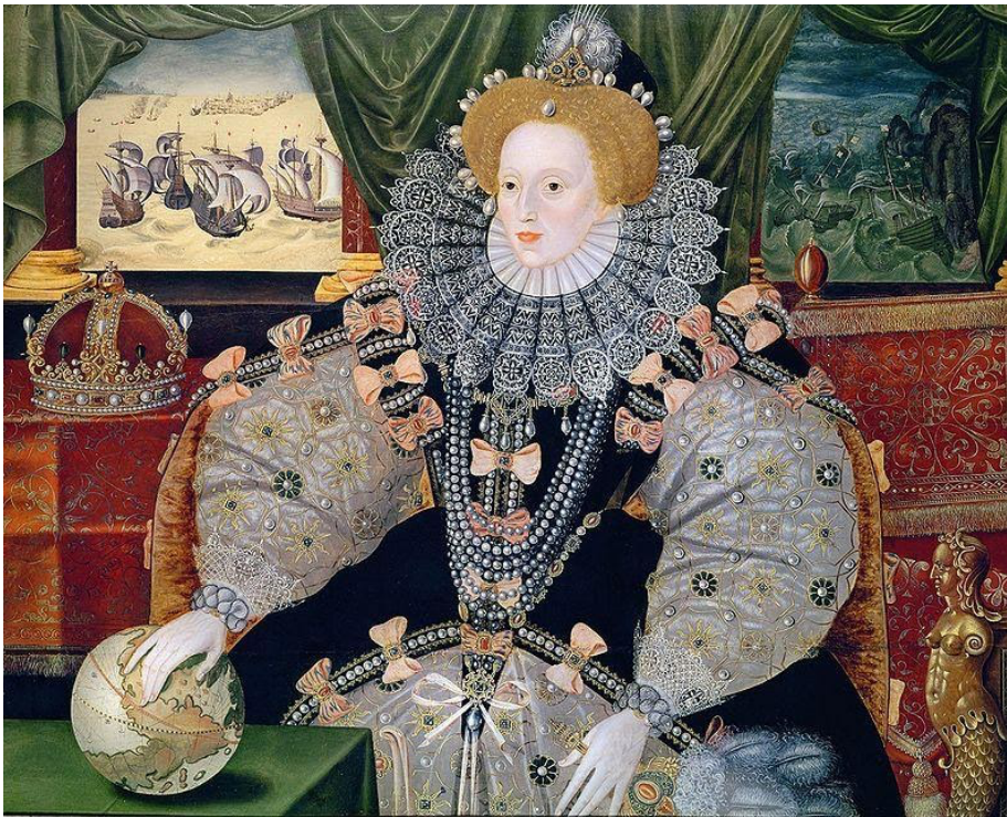
George Gower, "Armada Portrait" Oil Painting, 1588, Woburn Abbey.