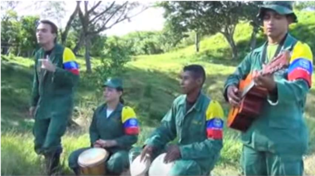
Figure 4. Screenshot from the FARC video, “Nos Vamos pa’ la Habana Música” (Paz, 2013).

The video was part joke, part challenge. But if the joking register intended to poke the government in the eye for being unable to defeat the FARC militarily, or to entirely control the framing of the upcoming negotiations, its success was ambiguous, since the video circulated as the butt of ridicule on social media, where the urbane laughed (with varying degrees of discomfort) at the FARC’s clumsy foray into Latin hip-hop. The production quality was so poor that it posed no significant threat to hegemonic media constructions in Colombia.