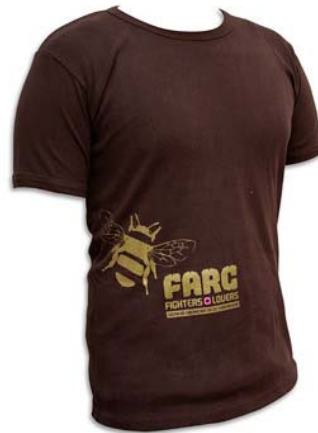
Figure 2. A screenshot from the Fighters and Lovers website, taken during April 2009, featuring a pro-FARC T-shirt marketed by the group.