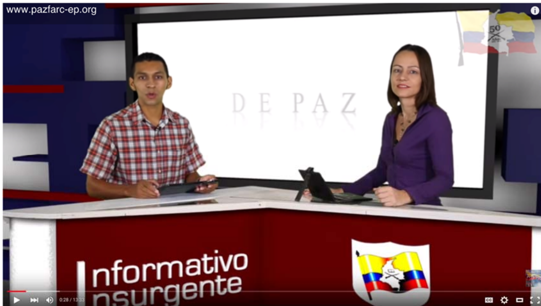
Figure 3. Anchorpeople for the Insurgent Bulletin.

(Figure 3). 12 In what follows, I analyze the economy of signs in the Insurgent Bulletin . By homing my analysis on the stylistic elements of the FARC media operation, I tease apart how the group projected an image of political legitimacy in preparation for political life after a peace accord.