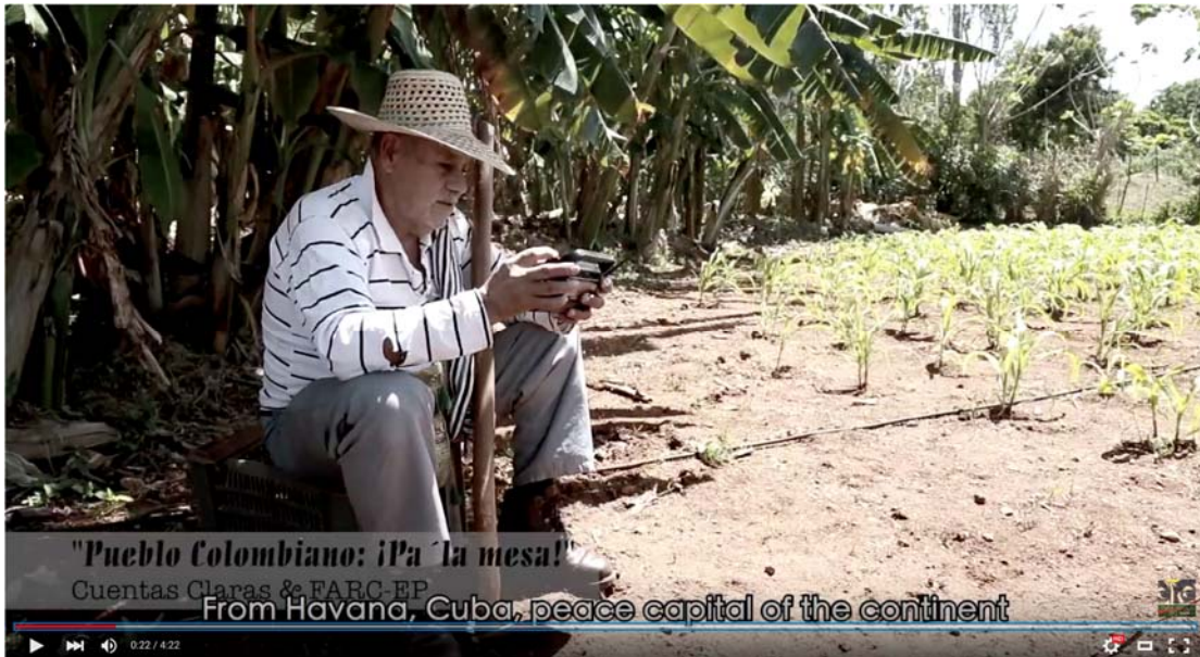
Figure 8. Screenshot from the FARC's Latin hip-hop song with Cuentas Claras (Paz, 2014).

The rap itself covers a wide range of topics, but unlike the FARC's previous music video, now there is rhyme, rhythm, and high-end production. The flow is difficult to reproduce in English translation, but consider the following verse (emphasis added):