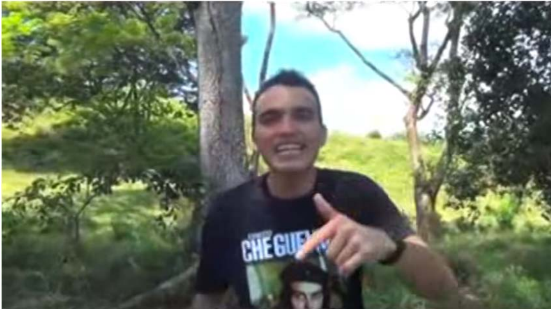
Figure 5. Screenshot from the FARC video, "Nos Vamos pa' la Habana Música" (Paz, 2013).