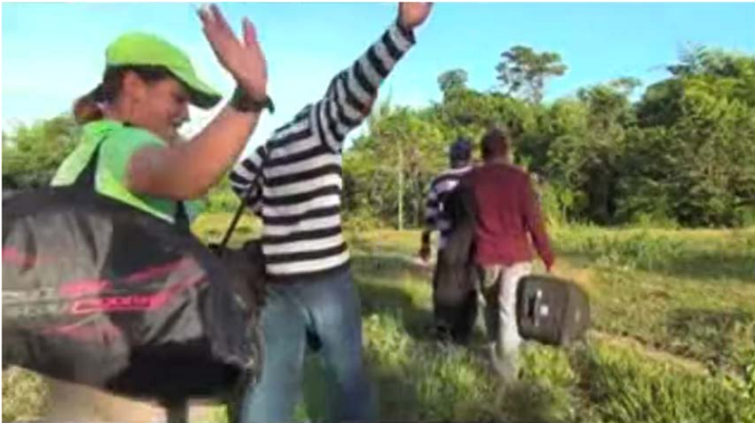
Figure 6. Screenshot from the FARC video, "Nos Vamos pa' la Habana Música" (Paz, 2013).

The laughably low-tech reposted August 13, 2013 production of the earlier September 2012 video stands in sharp contrast to the hip-hop video the FARC produced in collaboration with the Cuban rap