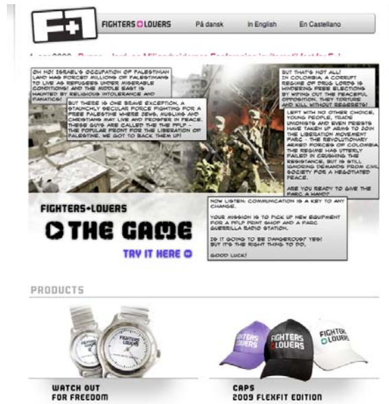
Figure 1. A screenshot from the Fighters and Lovers website, taken during April 2009, featuring an interactive video game, watches, hats, and a cartoon for the group's cause.