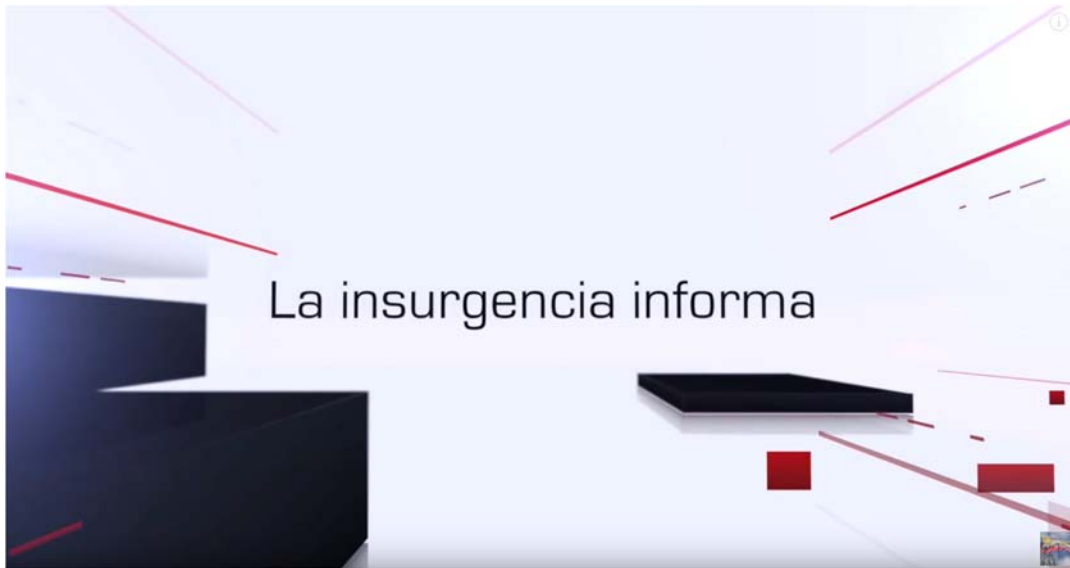
Figure 11. Screenshot from Insurgent Bulletin no. 56 ( https://www.youtube.com/watch?v=3CXkWfmkvqQ ).