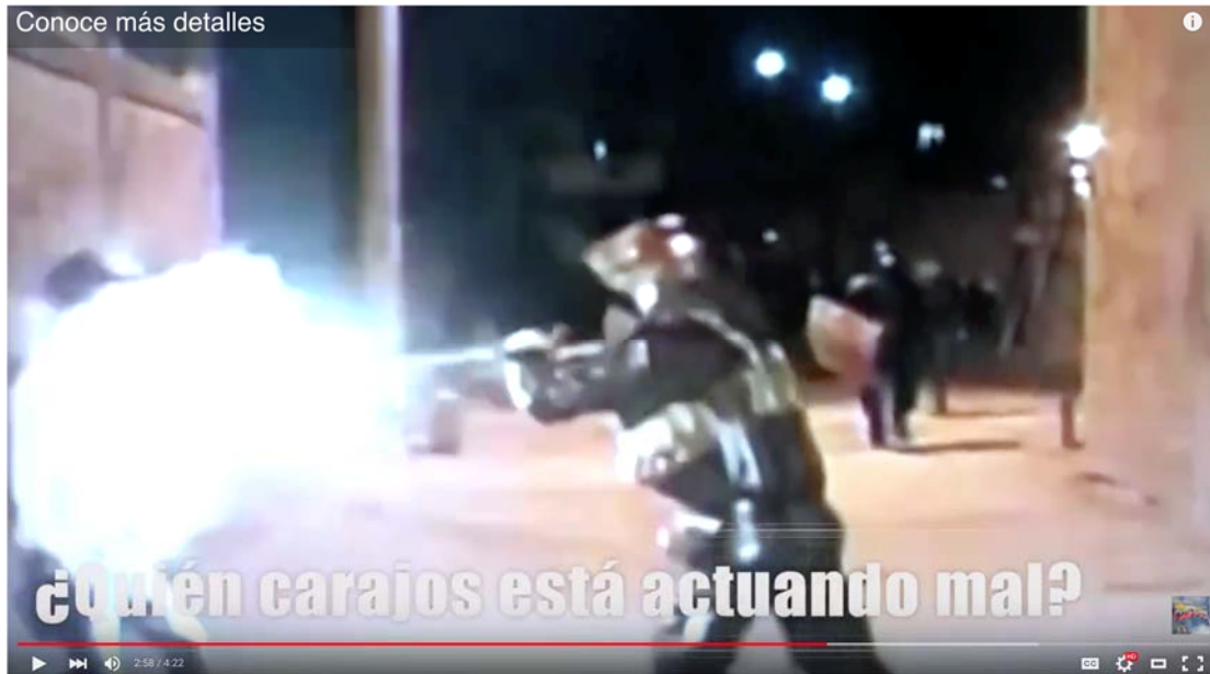
Figure 9. Screenshot from the FARC's Latin hip-hop song with Cuentas Claras (Paz, 2014). The title reads, "Who the fuck is acting badly?"

peace delegation, "We are absolutely certain that you can't do politics in the 21st century without impacting mass media and social networks" (personal communication, March 16, 2016).