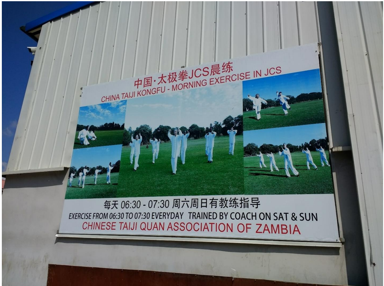
Photograph 15: Advertisement for 太极拳 “tai chi” group activities at the Chinese Market. Kombela, Central Zambia.