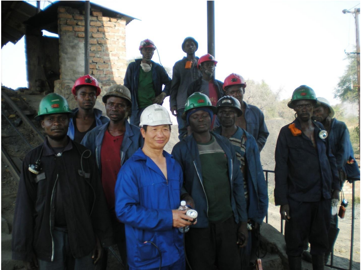
Photograph 11: A crew at Summers Mine prepare to descend underground, overseen by their Chinese shift boss.

Summers Coal Mine, Southern Province, Zambia. September 2015.