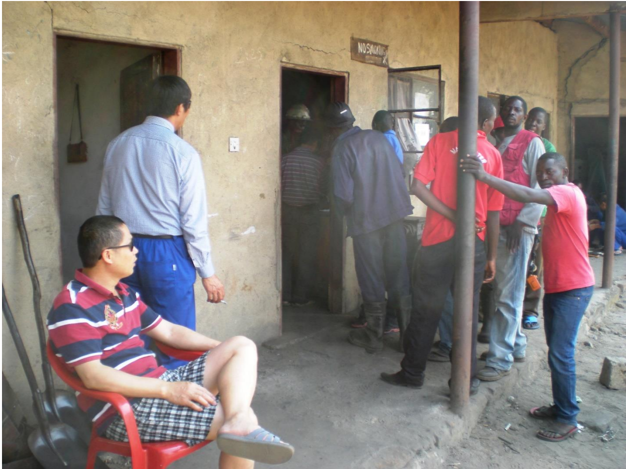
Photograph 8: Chinese managers look on as Zambian employees line up to receive their monthly wage. Summers Coal Mine, Southern Province, Zambia. September 2015.

Ferguson (2006) describes how over the course of three decades there was a major shift in the Zambian mining industry from what he calls socially thick to socially thin mining capitalism: once mines in Zambia had been engaged in not only mineral extraction but also long-term social investments such as the provision of housing, schools, and hospitals to their workers, who also received relatively high wages and other material benefits. These social provisions started to be abandoned across the Zambian mining industry in the 1990s, in the same period as widespread Chinese and other foreign investment entered the country, and Yan and Sautman (2012, 2014) note that by the 2010s Chinese mine operators had a reputation as particularly bad employers. Yan and Sautman refute this characterization by demonstrating the deep continuities between “Chinese”