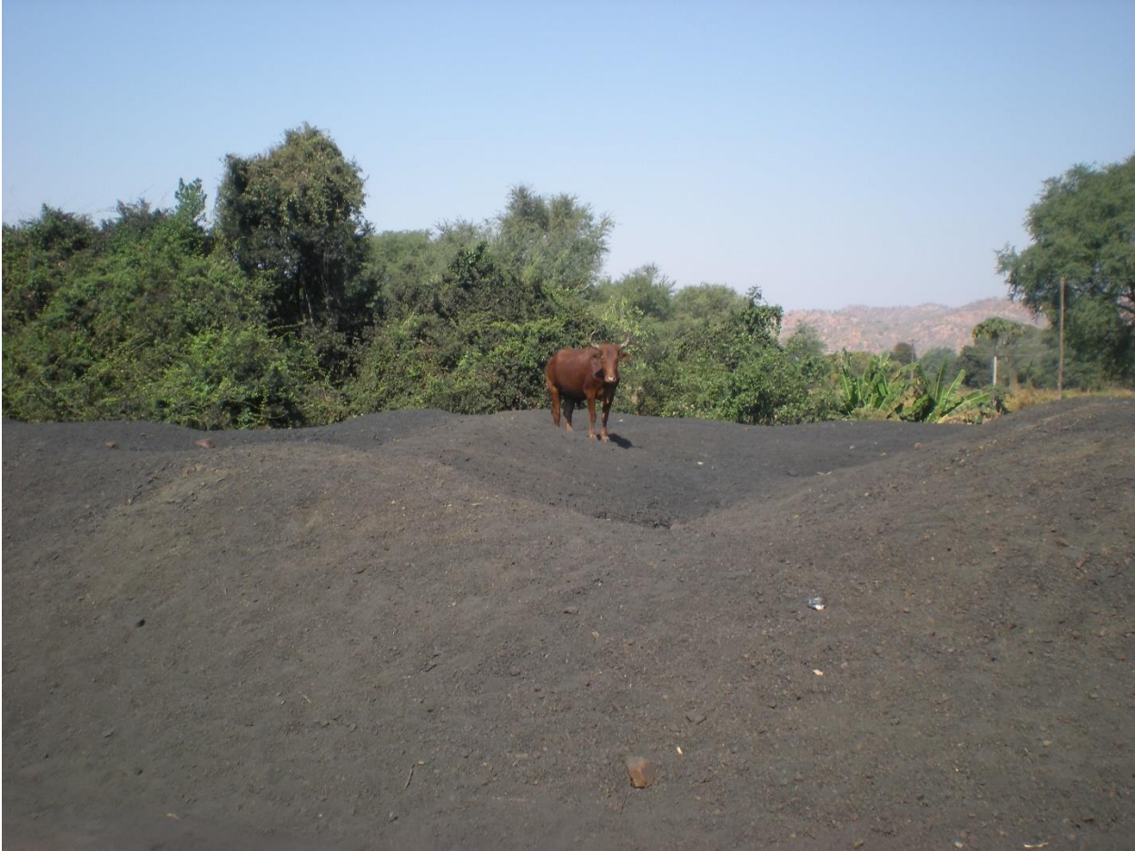
Photograph 3: A cow wanders over huge drifts of coal dust. Summers Coal Mine, Southern Province, Zambia.