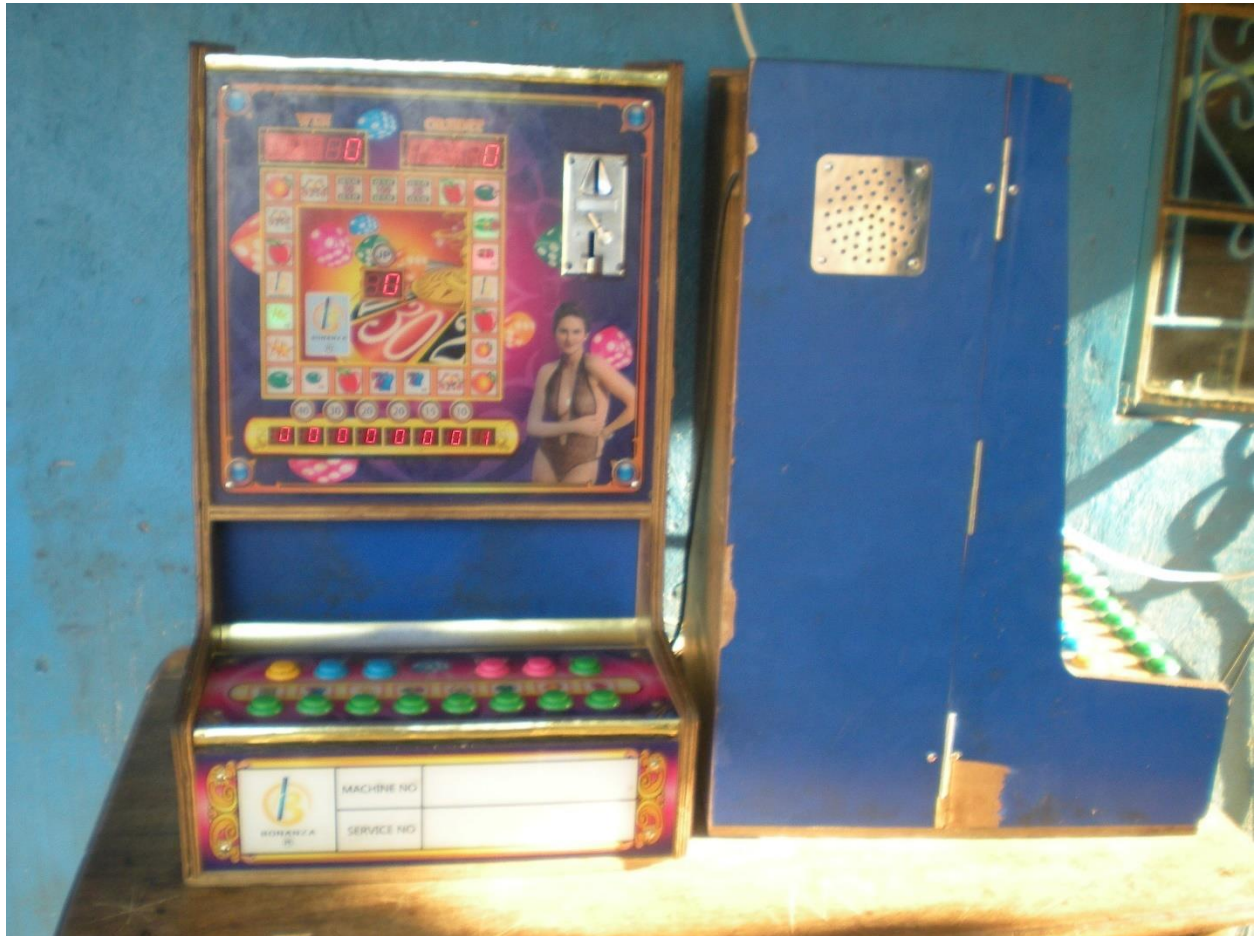
Photograph 7: Two Safari gambling machines installed outside of a bar. Mufulira, Copperbelt Province, Zambia. September 2015.

of the establishments where the machines are installed are given a negotiated percentage share of the proceeds. As in other parts of the world, these gambling machines tend to be marketed to and installed at locations where they are often used by some of the poorest members of township communities (cf. Schüll 2012).