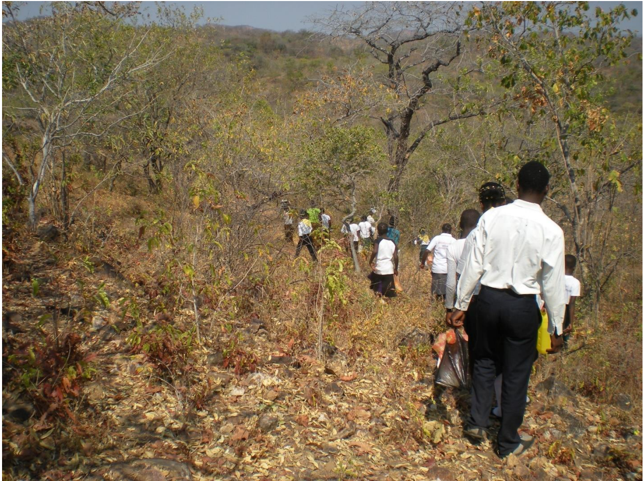
Photograph 18: The SDA Pathfinder youth take a day hike through the hills. Outskirts of Mugoda Village, Southern Province, Zambia. September 2015.