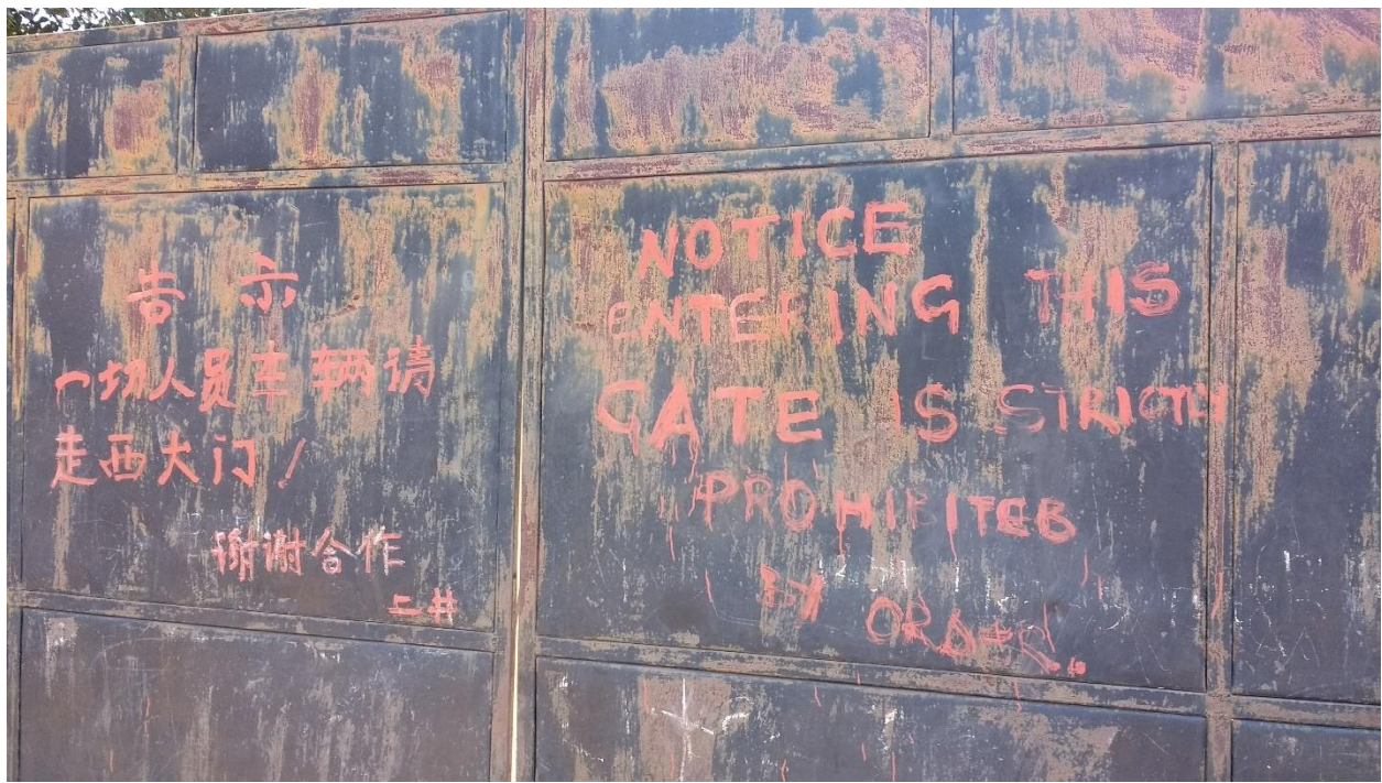
Photograph 9: A sign written in both Chinese and English. Summers Coal Mine, Southern Province, Zambia. October 2017.

the various languages prevalent at Summers Mine were varied. I am a native speaker of American English and have advanced proficiency in Mandarin Chinese and ciTonga, with rudimentary proficiency in CiBemba. As a result, I was sometimes asked by employees of the mine to help with small tasks of translation or interpretation (see photograph 9). Before arriving at Summers Mine, however, I had no familiarity with either Shortcut English or Gan Chinese, which made even my stumbling attempts at interpretation often far from perfect.