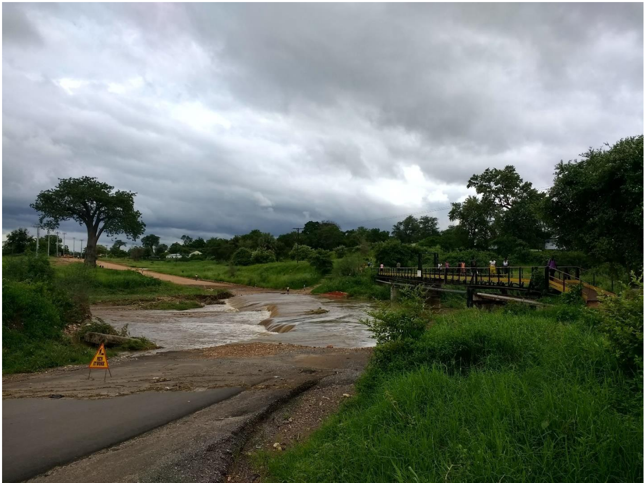
Photograph 6: A flooded vehicle road with adjacent pedestrian bridge. Hhaala Collieries, Southern Province, Zambia.

Due to the much greater size of its workforce and infrastructure, over the decades a significant township has grown up around Hhaala Collieries in contrast to the continuing rural surrounds of Mugoda Village around Summers Mine. With a population of about 13,000, Hhaala township includes not only a primary and secondary school but also a hospital, post office, and a number of guesthouses, shops, bars, and restaurants. Though it is a considerably larger settlement and has much more developed infrastructure than nearby Summers Mine and Mugoda Village, Hhaala Township is still quite remote by Zambian standards. Unlike at Summers and Mugoda, for example, Hhaala has paved asphalt roads but few vehicle bridges. As a result, its roads are still prone to overflowing during the rainy season (see photograph 6).