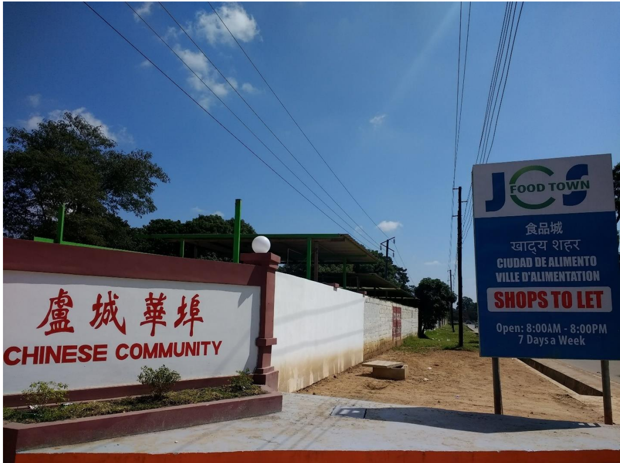
Photograph 14: The entrance to the Chinese Market. Kombela, Central Zambia. November 2018.

original center of the market, were popular among Zambians as well as Chinese and other foreign migrants alike, besides Jonah and I the patrons of the food court offering prepared Chinese dishes were almost always all Chinese.