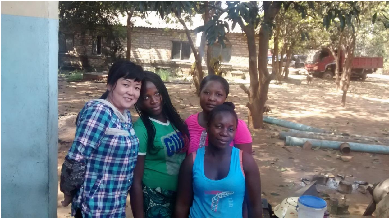
Photograph 12: A Chinese madame and the three Zambian women under her supervision. Summers Coal Mine, Southern Province, Zambia. August 2016.

Nevertheless in the course of their everyday labor (and other) interactions together the different language communities at Summers have been involved in the creation or replication of something new: namely a pidgin language that in its broad outlines resembles the pidgin spoken between Zambian and Chinese individuals throughout Zambia, known locally to residents and workers at Summers Mine as Shortcut English (from the idea of taking a “shortcut” to communicate one’s meaning) or Broken English . This pidgin draws its vocabulary almost exclusively from Zambian English, though the pronunciation of these vocabulary items can vary considerably from Standard Zambian English; it also includes a smattering of ciTonga, CiBemba, and Nyanja vocabulary items as well. There are some lexical items in the pidgin that are of unclear provenance, but none that I can clearly identify as originating from any variety of Chinese 10 . Nevertheless, the