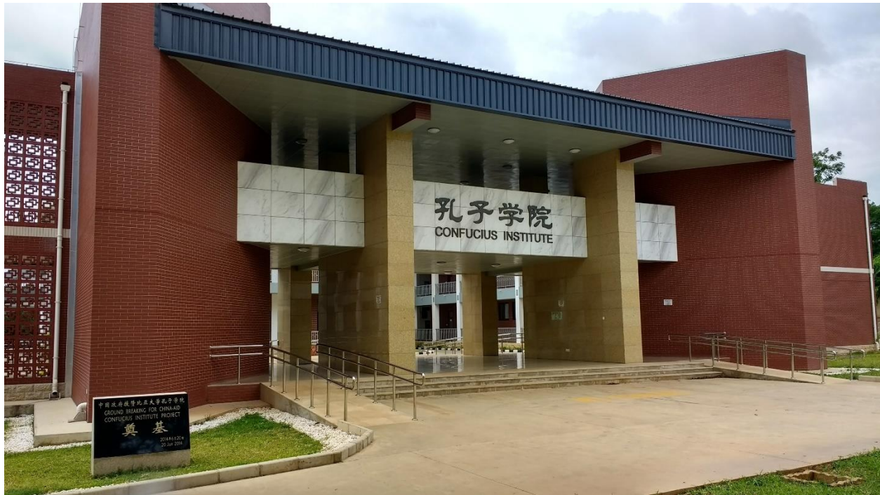
Photograph 1: The University of Zambia's newly-constructed 孔子学院 ( kongzi xueyuan /Confucius Institute) building. Lusaka, Lusaka Province, Zambia. May 2018.

community from more clearly white-collar, university-educated middle or upper-middle class backgrounds, generally fluent in British, American, or Australian Standard English, and employed at places like local Bank of China branches or at university 孔子学院 ( kongzi xueyuan /Confucius Institute) Mandarin-language training programs (see photograph 1).