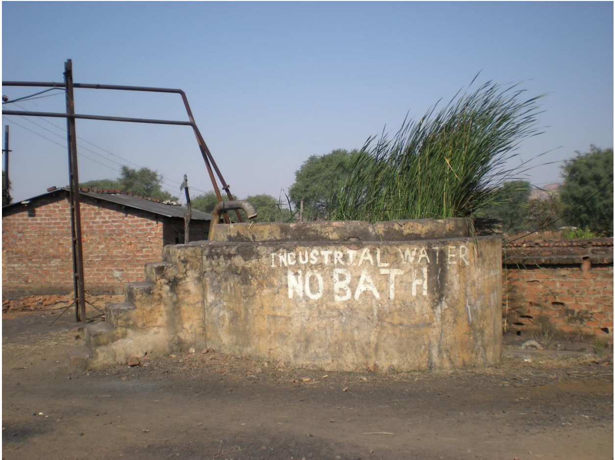
Photograph 4: A sign warns that water is used for industrial purposes and should not be used for bathing. Summers Coal Mine, Southern Province, Zambia. September 2015.