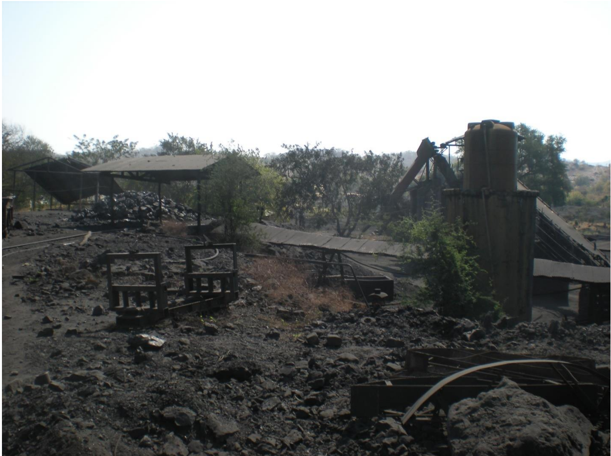
Photograph 2: The landscape just outside one of the mining shafts. Summers Coal Mine, Southern Province, Zambia. September 2016.

(PPE) provided to workers, use of “unsafe mining methods” and failure to prevent recurrence of fatal mine accidents, and hazardous chemical exposures to the surrounding communities (see photographs 2-5). For over two years the mine was operated only by a skeleton crew assigned to care and maintenance, to prevent the mine from falling into disrepair and losing value for a prospective sale, with no production of coal taking place during this two-year period.