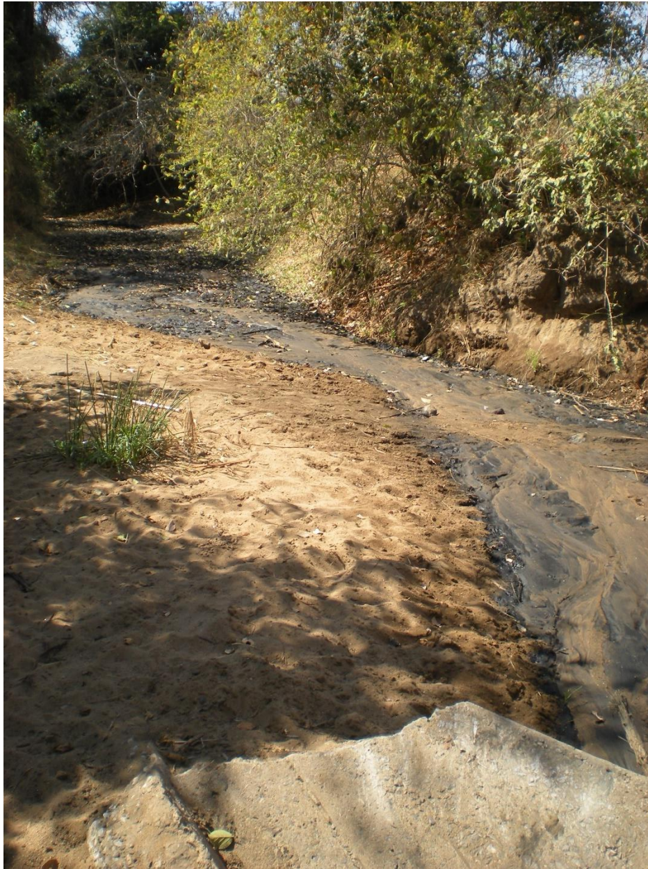
Photograph 5: A small stream polluted with mine run-off. Summers Coal Mine, Southern Province, Zambia. September 2015.

In October 2014 Zambian President Michael Sata, who had famously promoted a hostile, at times even xenophobic, political platform with regards to Chinese investment during some of his early presidential campaigns, passed away, and was replaced in January 2015 by his successor, Edgar Lungu. Just two months later, in March 2015, President Lungu met with President Xi Jinping of China in Beijing, and within weeks the Zambian government administration announced that,