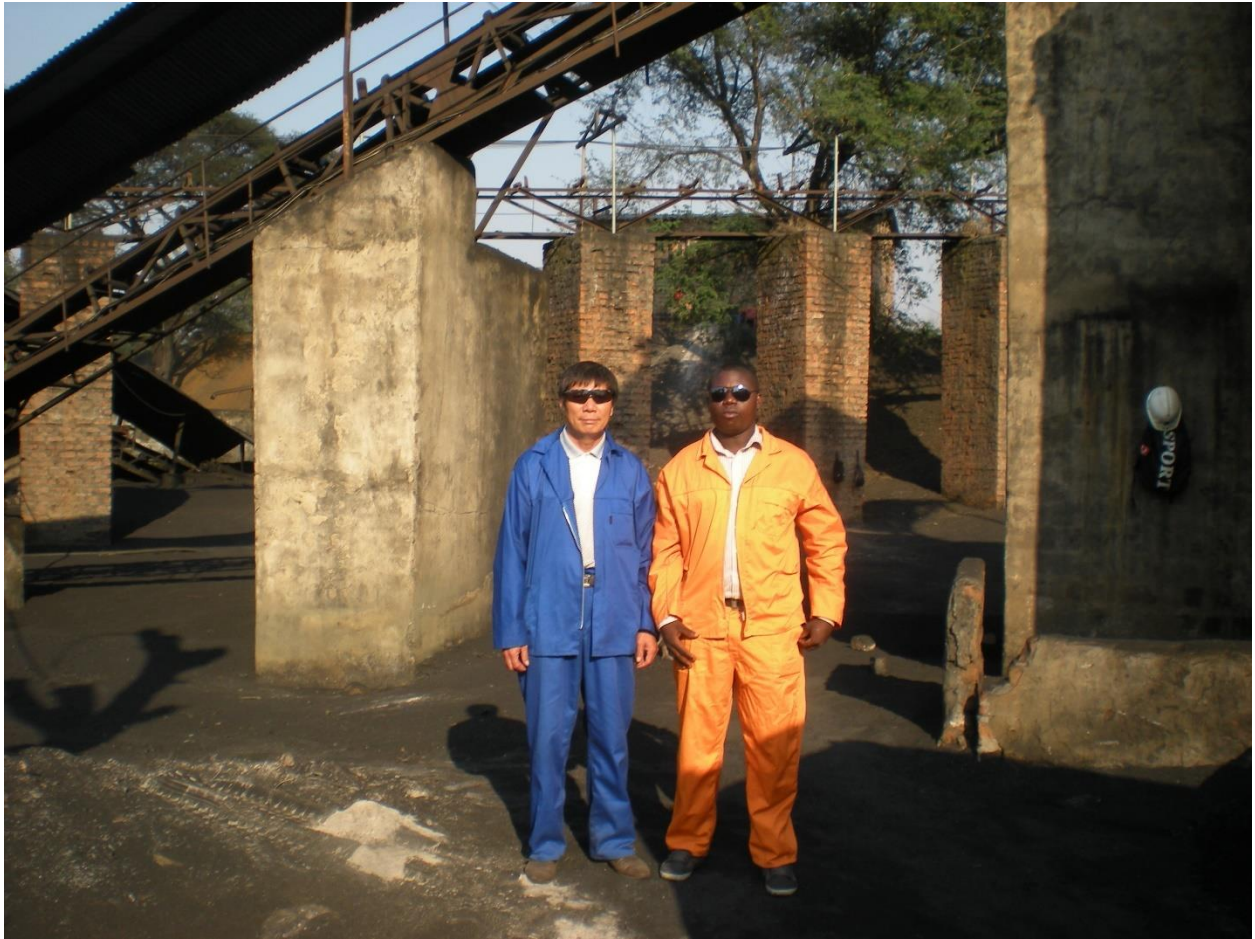
Photograph 10: A Chinese shift boss and a Zambian lorry (truck) driver strike a pose together. Summers Coal Mine, Southern Province, Zambia. September 2015.