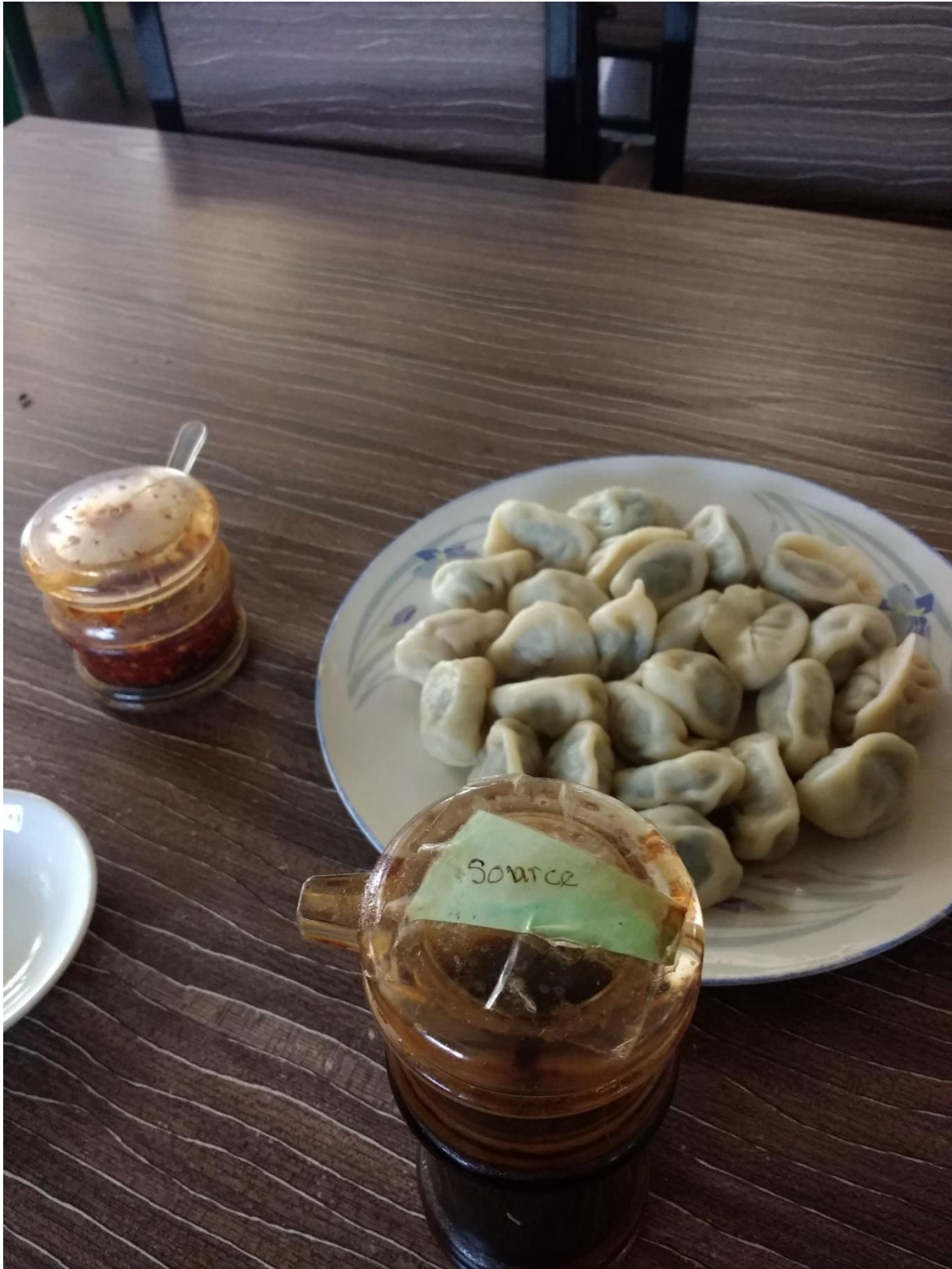
Photograph 17: 水饺 shuijiao /boiled dumplings served at the Chinese Market food court. Kombela, Central Zambia.