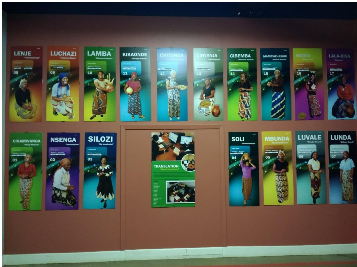
Photograph 13: A poster board advertising the many Zambian languages that Jehovah’s Witnesses preach in. Lusaka, Lusaka Province, Zambia. May 2018.

Like the Mandarin-language congregation that Jonah and I attended, these other foreign-language congregations were overwhelmingly composed of Zambian congregants who had no previous background in these languages, and who had moved to these congregations out of a voluntaristic desire to develop their abilities to evangelize to groups of people in Zambia (e.g. Chinese and Indian labor migrants and entrepreneurs, Congolese refugees, deaf member of any of Zambia’s ethnic communities) who otherwise were not proficient in spoken English or another Zambian language. Like Mandarin, proficiency in some of these languages such as Gujarati was otherwise exceedingly rare among Zambians who were not themselves members of the relevant diasporic communities.