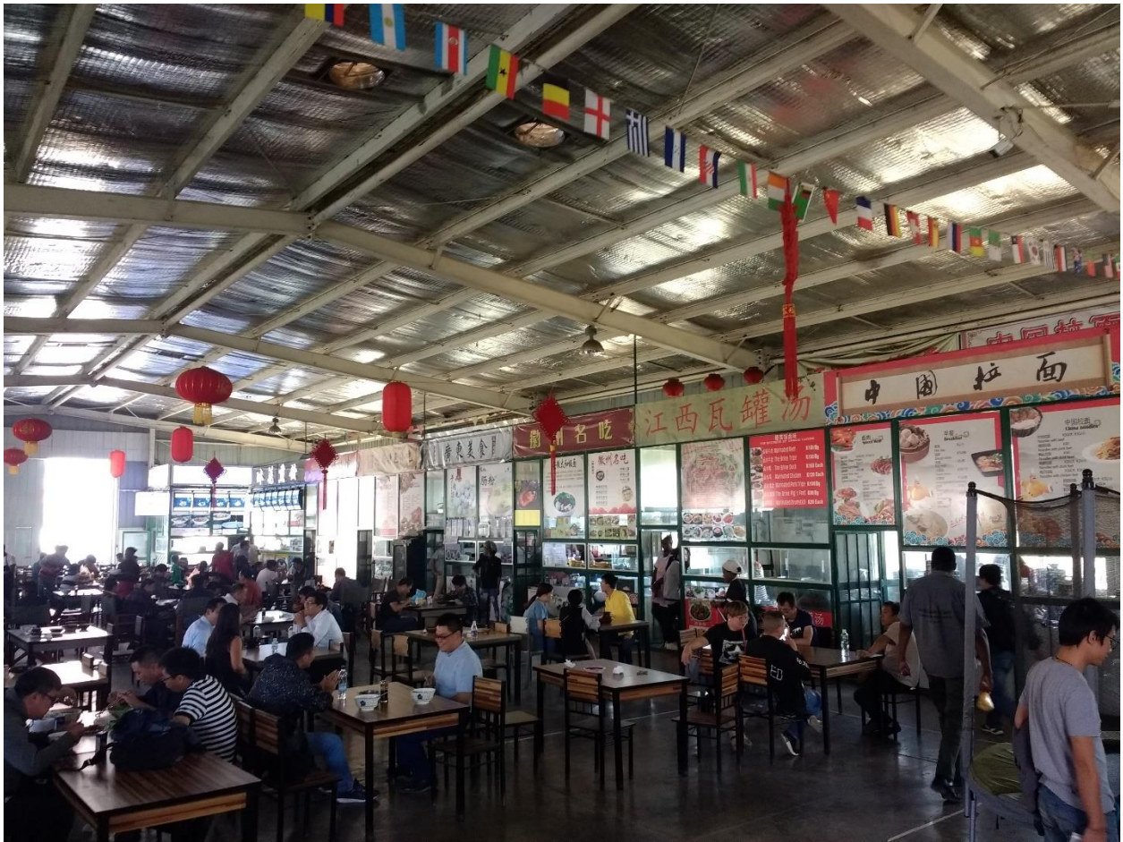
Photograph 16: Food court of regional Chinese food stalls at the Chinese Market. Kombela, Central Zambia. November 2018.