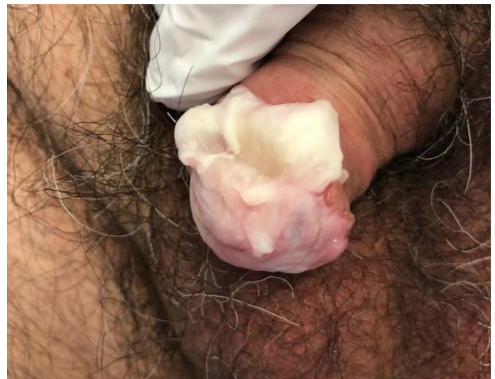
Figure 1. Clinical image of a whitish, thick, and hyperkeratotic plaque over the glans.

examination revealed a hyperkeratotic, thick, whitish plaque over the glans ( Figure 1 ), which was completely asymptomatic. The patient was uncircumcised. There was neither regional lymphadenopathy nor dysuria. Routine laboratory tests, including blood count, liver and renal function tests, erythrocyte sedimentation rate, and C-reactive protein levels were within normal limits. The patient's serologies were negative for HIV and hepatitis B and C viruses. Two penile biopsies had already been taken from the lesion some years earlier, with histological diagnosis of lichen sclerosus et atrophicus. The patient had previously been treated with topical corticosteroids, emollients, and calcineurin inhibitors without any improvements.