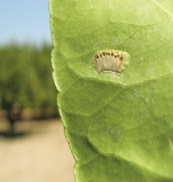
Parasitoid exit holes on a citrus leaf indicate that adults successfully chewed through the egg casing and leaf epidermis to emerge.