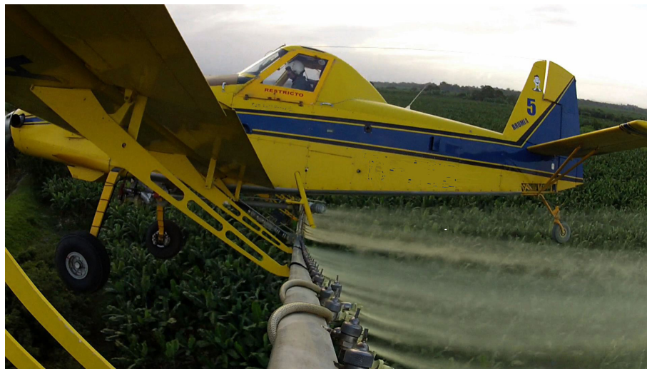
Figure 1. Aerial application of mancozeb at banana plantations in Costa Rica.

Study procedure. Women were interviewed in their homes one to three times during pregnancy depending on gestational age at enrollment. Mean ( \pm SD) time between first and second, and second and third, visit was 10.6 \pm 4.0 and 9.6 \pm 3.6 weeks, respectively. A urine sample was obtained at each visit. During the visits blood and hair samples were also collected; results from these samples have been reported elsewhere (Mora et al. 2014). In addition, clinical information was abstracted from the Prenatal Health Card, which is provided to pregnant women by the Costa Rica Social Security (CCSS) and is completed by physicians and nurses at each prenatal care visit. Gestational age at day of visit was calculated on the basis of the first day of the last menstrual period (LMP) as reported by each woman. When LMP was unknown ( n = 18 ), gestational age was based on ultrasound ( n = 5 ) or physicians report (fundal height, n = 10 ). Three women lacked information on gestational age and were excluded from data analysis. An additional three women did not provide a urine sample. We obtained 872 urine samples from the remaining