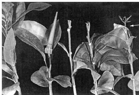
Fig. 1. Microbudding steps: microbudding and capping with a pipet tip, followed by cap removal after callusing. The arrow indicates new scion growth.

Biological indexing was performed for the identification of citrus tristeza virus, psorosis virus, citrus exocortis viroid (CEVd), and citrus tatterleaf virus (CTLV). Indicator plants of Mexican lime, pineapple sweet orange, Etrog citron, and Troyer citrange were microbudded