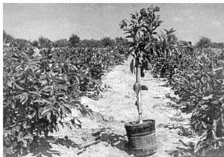
Fig. 3. Microbudded trees in the field grew very well and out performed comparable trees grown conventionally. The tree in the pot was grown and budded using conventional procedures and rootstock seed were prepared at the same time.