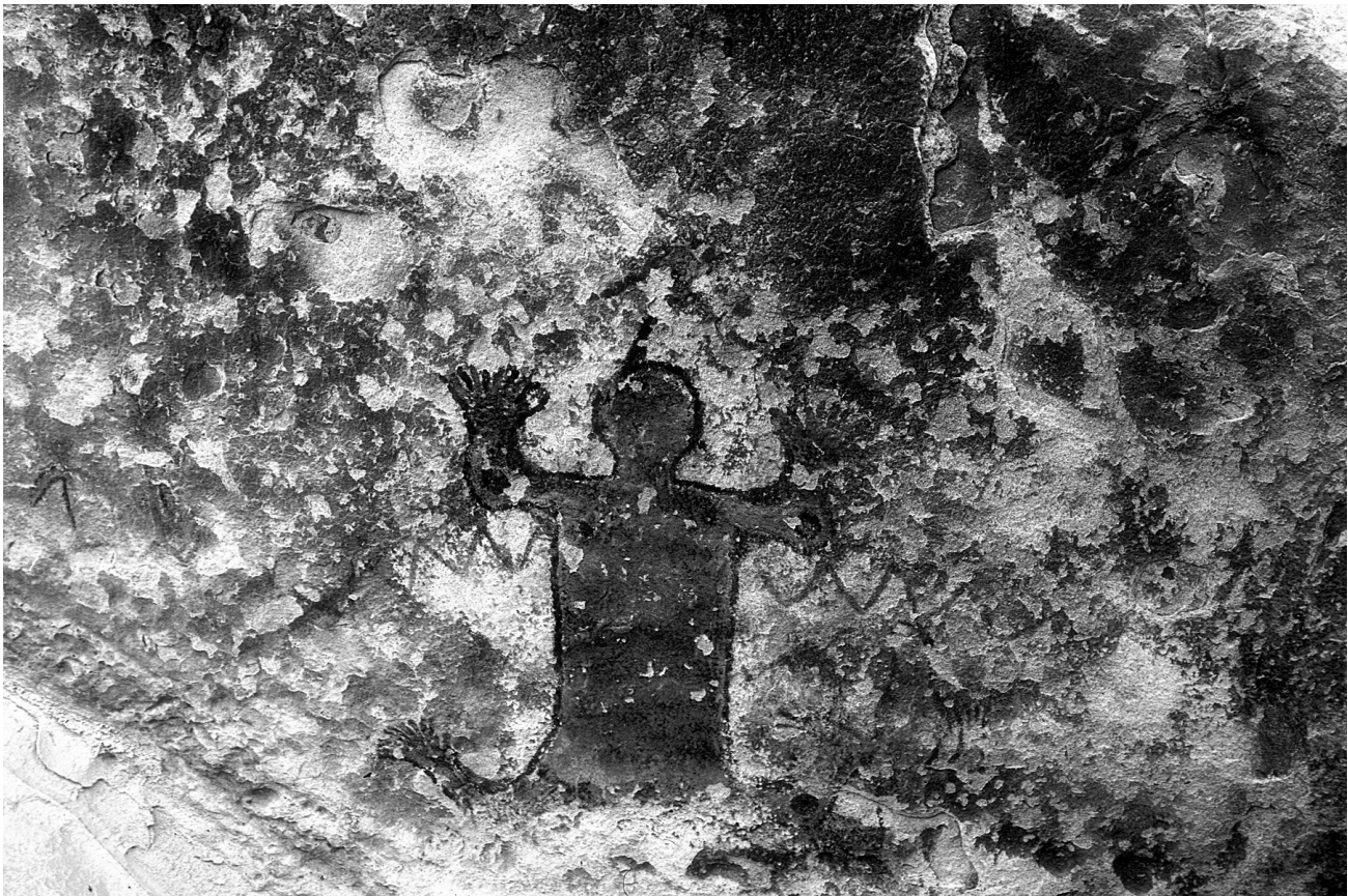
Figure 2. Hyder's photograph of the figure incorrectly illustrated in Saint-Onge, Johnson, and Talaugon (2009: Figure 5b). Red pigment has been digitally emphasized as a dark black to help it stand out in contrast to the lighter black pigment.

In that light, we draw attention to another painting at the same Carrizo site that was also published by Grant (1965: Plate 11). The central figure in the panel appears to be a black angel with wings and a fancy headdress, and with a pinwheel for a belly button. However, the actual rock painting varies from Grant's drawing in significant ways (Fig. 3). What Grant interpreted as "wings" are actually outstretched arms with large fingers. Curved lines above the arms were misinterpreted as the tops of wings. In addition, the "body" of the figure extends further down than is shown in Grant's rendition. This panel is badly eroded and is very faint, and it is not our intention to disparage Grant's work; we wish only to point out that using secondary methods (such as projectors or light tables) can result in erroneously interpreted motifs.