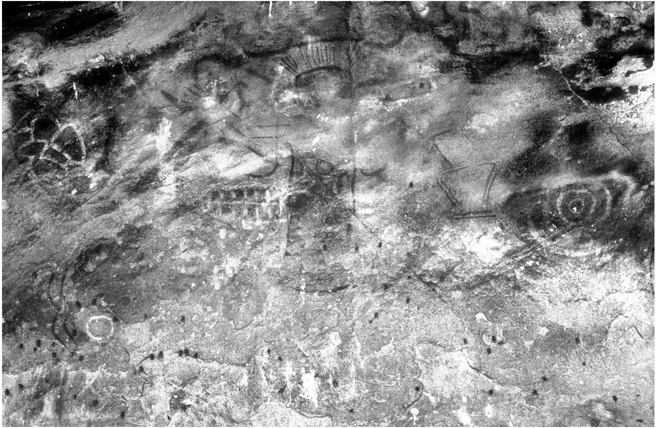
Figure 3. Hyder's photograph of the black "angel-like" figure incorrectly reproduced by Grant (1965).