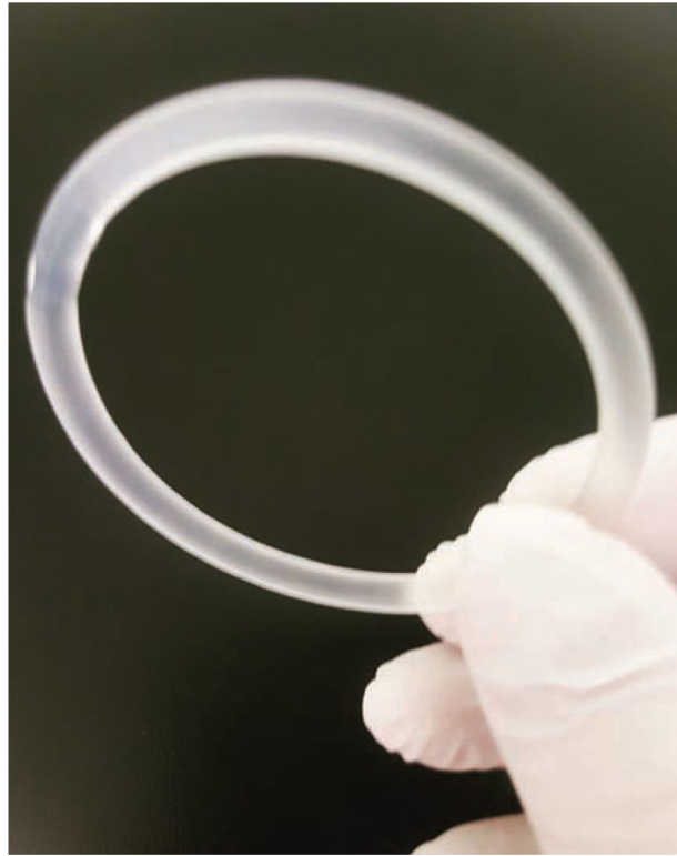
Figure 3. The Vaginal Ring