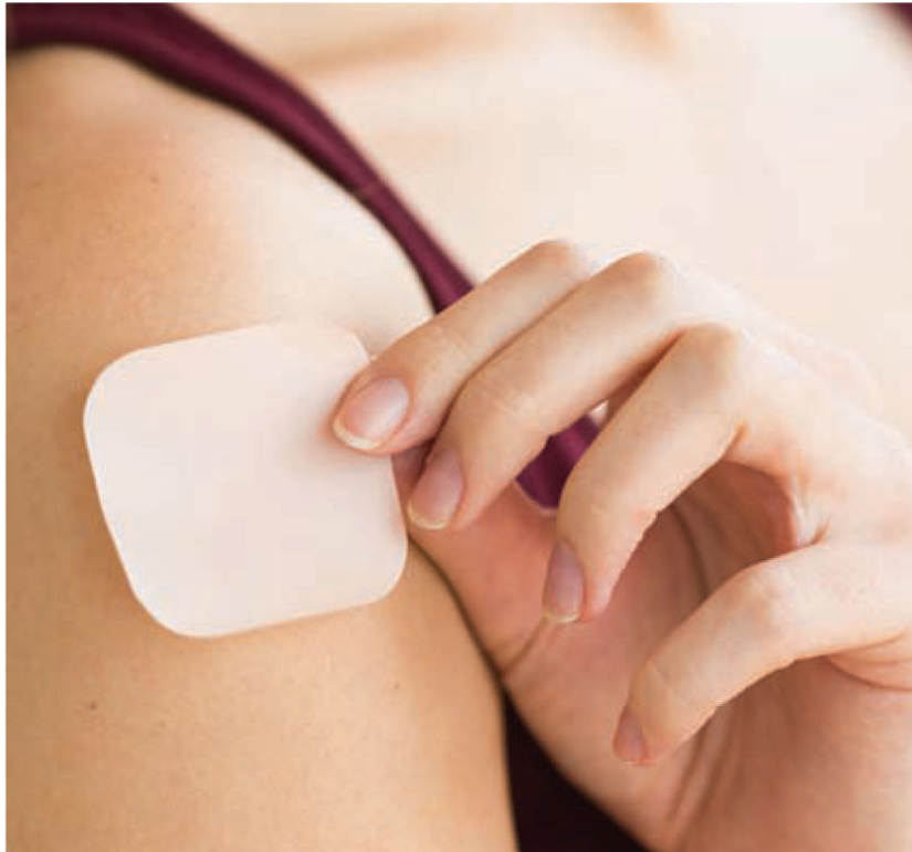
Figure 2. The Transdermal Patch