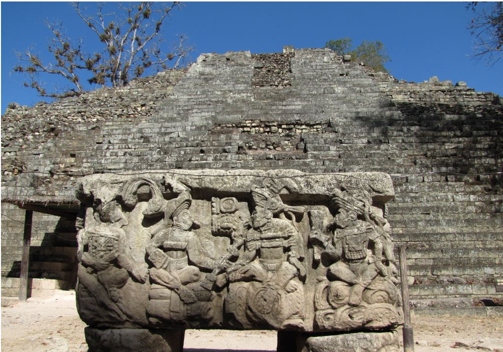
Figure 3: front face of Altar Q, in front of Copan Structure 10L-16. K'inich Yax K'uk' Mo' (center left) hands the scepter of rulership to the 16 th member of the dynasty, Yax Pahsaj Chan Yopaat (center right).

Critical within Stuart’s translation of the Altar Q text was the recognition of a referenced place. The hieroglyphic text notes that Yax K’uk’ Mo’ first became a prince at a foreign location (Stuart 2000). He then left that place, journeying for 152 days, before arriving at Copán. The place from which he came thereafter provided his legitimacy for rulership, telling us two things. For one, we have an historical statement that Yax K’uk’ Mo’ was a foreigner, thus corroborating the inference that