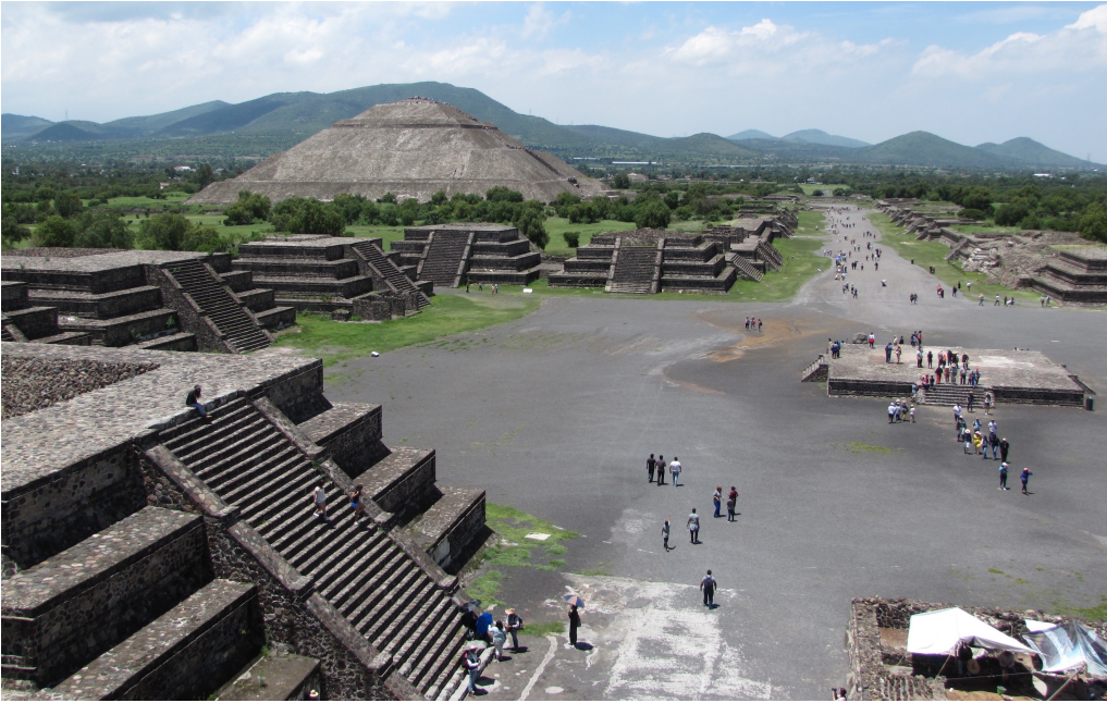
Figure 1: View from the Pyramid of the Moon at Teotihuacan, looking south along the Miccaotli ('Street of the Dead'). The structures around the plaza in the foreground are all constructed with the distinctive talud-tablero façade.

of the Copán royal dynasty. After considering these representations, this essay moves on to discuss the ramifications of identifying parallels to Chican@ ideologies within indigenous histories, advocating a new discourse between anthropo- and archaeo-logies and ethnic and indigenous studies as an enterprise of critical importance to the responsible development of each.