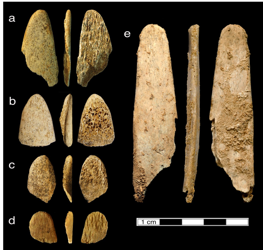
Figure 1. Photographs of the (a) Pech-de-l'Azé I (PA I) and (b–e) Abri Peyrony (AP) lissoirs . (a) PA I G8-1417. (b) AP-4209. (c) AP-4493. (d) AP-10818, newly published here. (e) AP-7839. Adapted/modified from 4 .