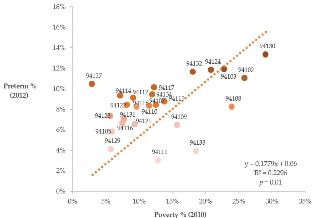
Figure 2. The correlation between percent PTB ( y -axis) and percent poverty ( x -axis) by neighborhood (zip code) in SF with a significant p -value (0.01) and R^2 value = 0.23 positive correlation trends. The darker the gradient color, the higher PTB % and Poverty %, y = Preterm % (2012), x = Poverty % (2010).

were consistent with an unpaired t -test (two-sample t -test with unequal variances) that showed significant mean differences in Pb concentration by PTB, poverty, African American/Black population, foreign-born, bachelor's degree, and Gini index ( p < 0.001 ) (Supplementary Table S2). However, there was no significant correlation between Pb levels and percent foreign-born nor with poverty ( p > 0.05 ).