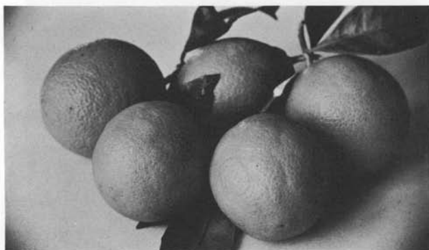
FIGURE 3. Fruits of Ovale orange showing symptoms similar to those in Figure 1.

TEST OF IMPIETRATURA INFECTION OF GRAPEFRUIT TREES FROM FLORIDA. —In 1962, 3-4 buds per tree were collected from 89 grapefruit trees