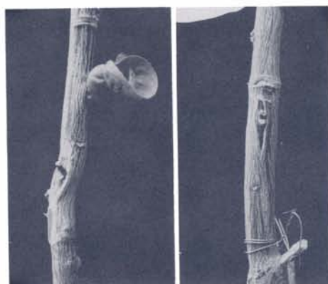
Fig. 3. Development of citron buds grafted onto Frost satsuma (left) and Verna lemon (right) infected with the E-117 isolate.

Frost satsuma, but after three months, enough tissue (2-3 g) was collected for viroid analysis. The buds on Verna lemon and Nules clementine did not