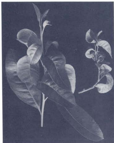
Fig. 1. Reaction on Etrog citron: plant in the left was inoculated with bark patches from Frost satsuma, and plant in the right was inoculated with bark patches from Pineapple sweet orange which contained the E-117 isolate.

In order to address the question of whether CEV was actually present in the inoculated Frost satsuma and Navelina sweet orange, these trees were budded with two healthy citron-buds each. The citron buds developed poorly on Navelina sweet orange and