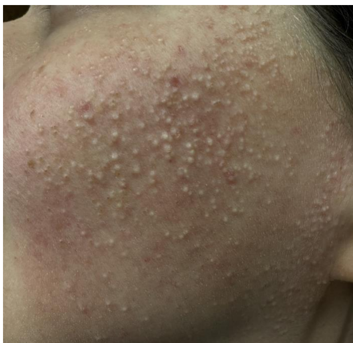
Figure 1. Numerous milia of the cheeks, forehead, superior neck, and preauricular and postauricular skin with underlying erythema in a woman.

superior neck, or preauricular and postauricular skin with underlying erythema ( Figure 1 ). These papules were firm to palpation, with no content extraction with external pressure application. The biopsy showed cysts within hair follicles containing layers of stratified squamous epithelium, a granular cell layer, and inner keratinous material. There was additional background lymphohistiocytic infiltrate suggesting possible concomitant inflammation ( Figure 2 ). These findings, paired with the clinical picture, led to the diagnosis of multiple eruptive milia (MEM). Glycolic facial peels and consistent use of topical tretinoin 0.025% showed no appreciable response. She has since been initiated on doxycycline 100mg daily with topical metronidazole 0.75%.