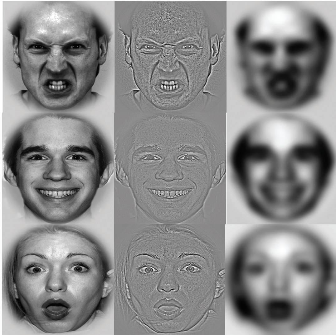
FIGURE 1 | Example stimuli. Normal broad spatial frequency (BSF) angry, happy, and surprised faces (left column), high spatial frequency (HSF) faces (middle column), low spatial frequency (LSF) faces (right column).