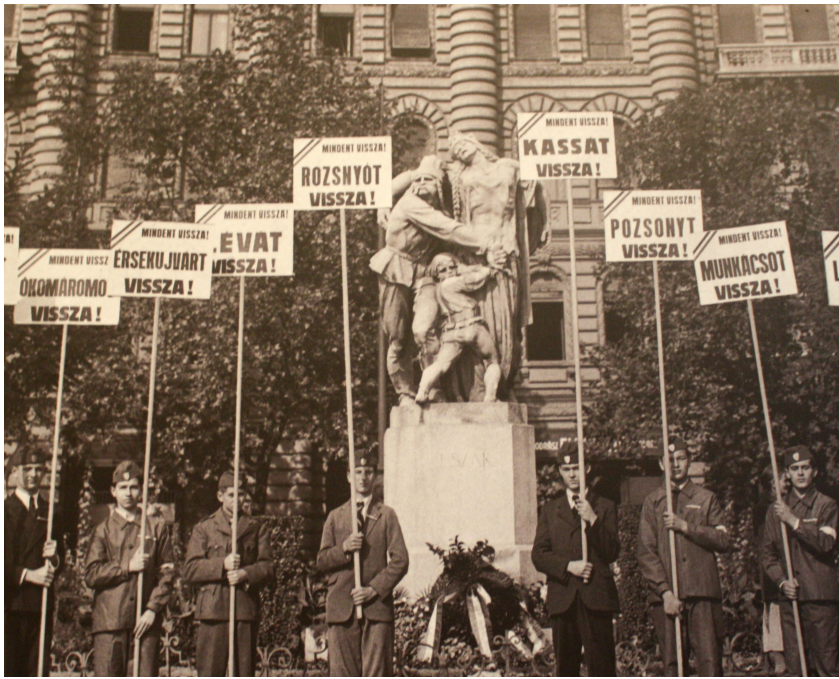
Figure 6: Rally for the return of Felvidék in front of the “North” statue in Szabadság Square, 1938.