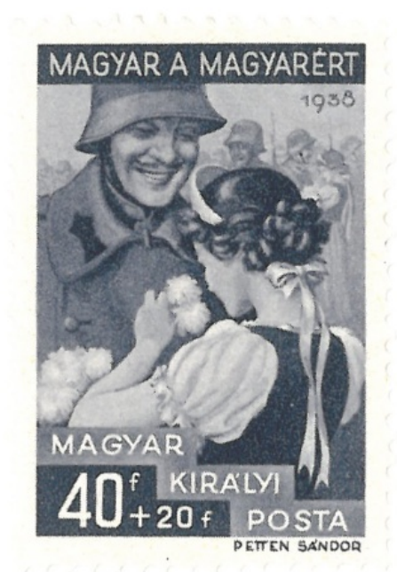
Figure 10: Hungarians for Hungarians Movement commemorative stamp.

entry—Horthy atop a white horse as he leads the Hungarian army into Komárom and young girls in folk costume presenting flowers to Hungarian troops. Another stamp contained an image of the North statue that stood in Szabadság Square. The final two stamps were renditions of places in Felvidék, the St. Elizabeth Cathedral in Kassa and the Munkács Castle, two buildings historically associated with Hungarians that had now returned to the Hungarian state. The commemorative stamps thus contained all the legitimizing elements that had become so commonplace during the re-entry: the historical continuity of Hungarian places, the proud and beloved Hungarian army, and the regent as the leader adored by his people.