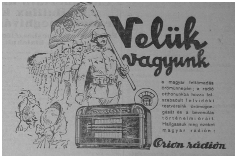
Figure 9: “We are with you” advertisement for Orion Radio’s broadcasts of the entry of Hungarian troops into Felvidék.

atmosphere of the celebrations and, in a small way, to participate in the renewal of the nation. Each day, national newspapers covered the procession through Felvidék in detail. Stories ran aimed at reacquainting the readership with the returned territory. Radio stations broadcasted the ceremonies so that those in Hungary could follow along. “Through Standard Radio, those who cannot travel to Felvidék can rejoice at home,” advertised one station. 167 Another exclaimed, “We are with you! During the celebration of the Hungarian resurrection, radio brings into our homes the jubilation of our freed brothers in Felvidék and the historical moments of the re-entry. Listen to this on Hungarian radio: Orion Radio.” 168 Finally, people could go to movie houses to see footage of Hungarian soldiers marching into Felvidék and the crowds that awaited them. Already by November 9 theaters were running films with scenes from the re-entry. 169