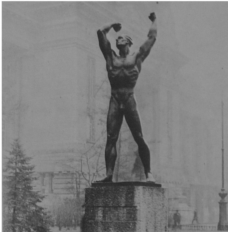
Figure 7: Statue of Hungarian Resurrection in Szabadság Square. The statue was relocated to Kassa in 1940 to commemorate the city’s return to Hungary.