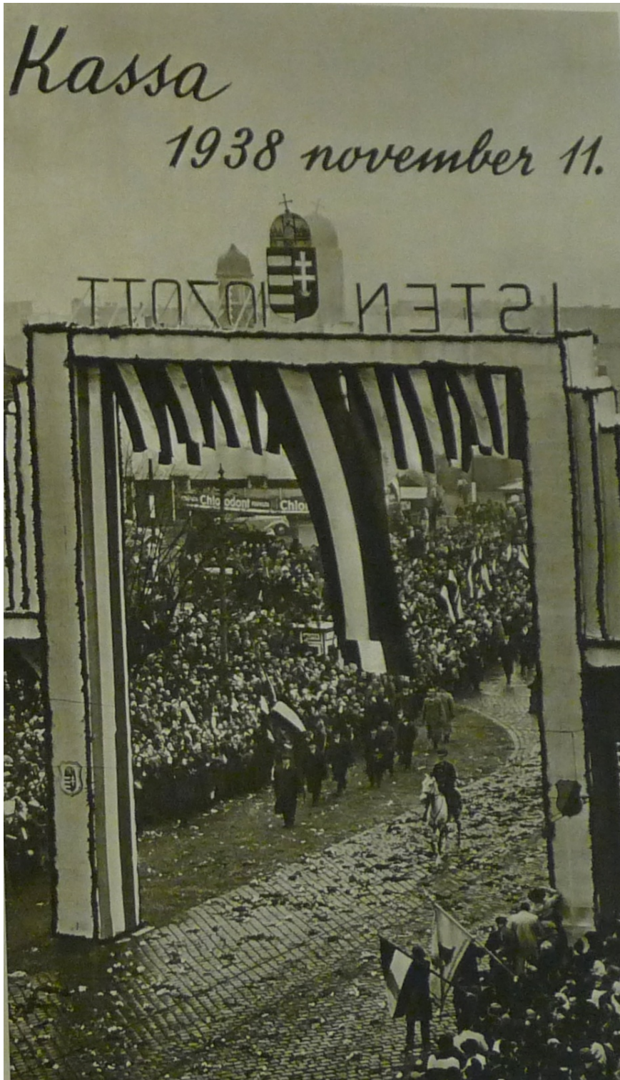
Figure 4: Horthy enters Kassa at the head of the Hungarian army.