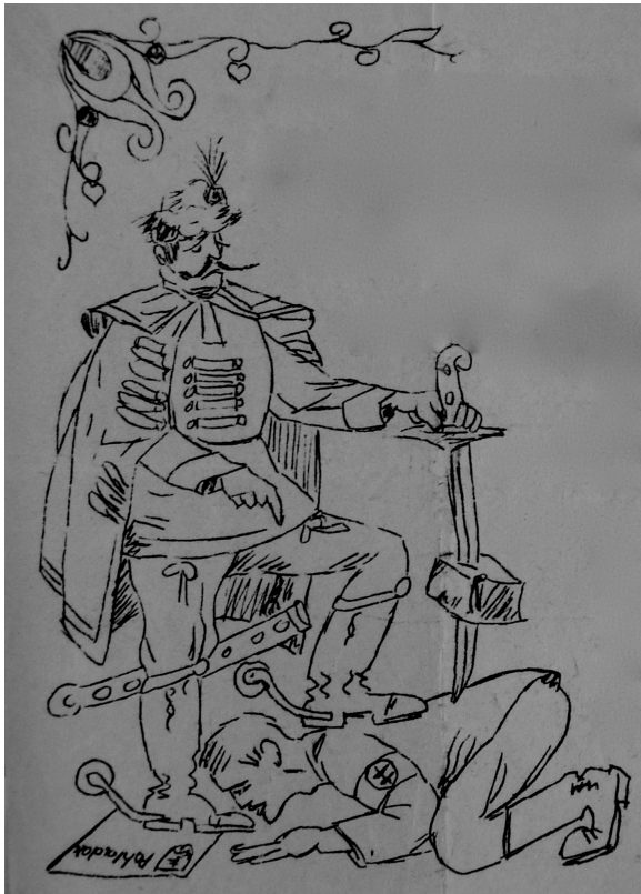
Figure 13: Slovak anti-Hungarian propaganda depicting a Hungarian count forcing a Slovak Hlinka Guardsman to kiss his riding boot.

authorities in 1940 stated. “In Hungary the entire state apparatus, state power, the land, and two-thirds of the means of production are in the hands of a few thousand people. . . . And this caste would like to rule over all Central Europe.” It was for these reasons, the Slovak author contended, that “Hungary cannot organize the self-conscious nationalities of Central Europe and solve the nationality problems.” 67 Emphasizing Hungary’s dubious record on social issues and coloring the discussion with anti-Semitic discourse enabled Slovak propagandists to simultaneously target Slovak masses and German backers alike.