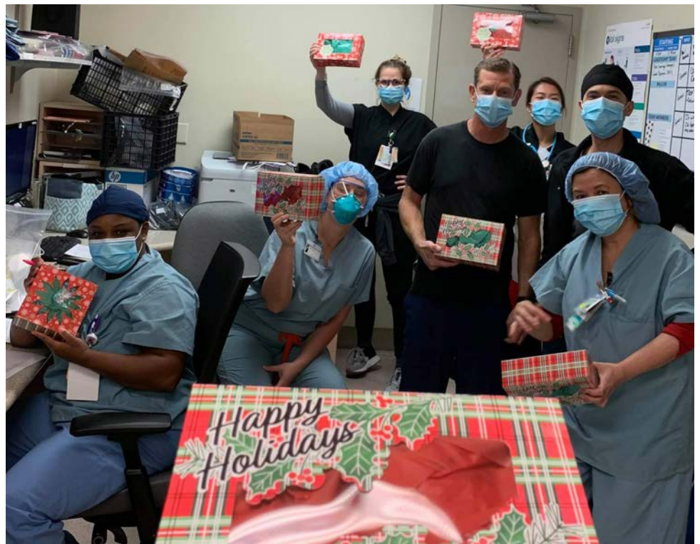
6th Floor spreading some 'COVID-friendly' holiday cheer...