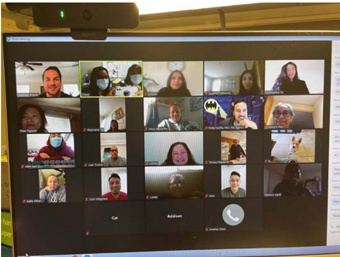
11th Floor Progressive Care Unit Based Practice Meetings being held via Zoom as pivot solution to endure pandemic restrictions