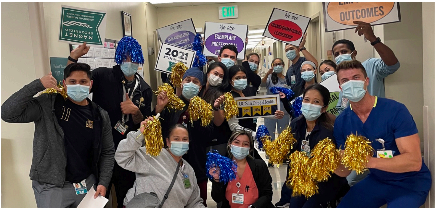
11th Floor Progressive Care Unit finding ways to celebrate Magnet re-designation in spite of pandemic