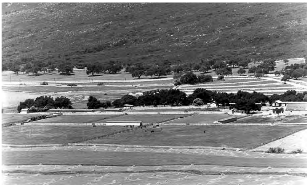
Baron Long Ranch, ca. 1930, was a level, fertile field on the floor of the Viejas Valley. When this photo was taken, erosion was negligible. ©SDHC #5271.

on non-Indians. 15 The so-called “Scattergood suggestion” was dispersal: “ending of tribal life and location [of Indians] on individual plots of land near population centers.” 16