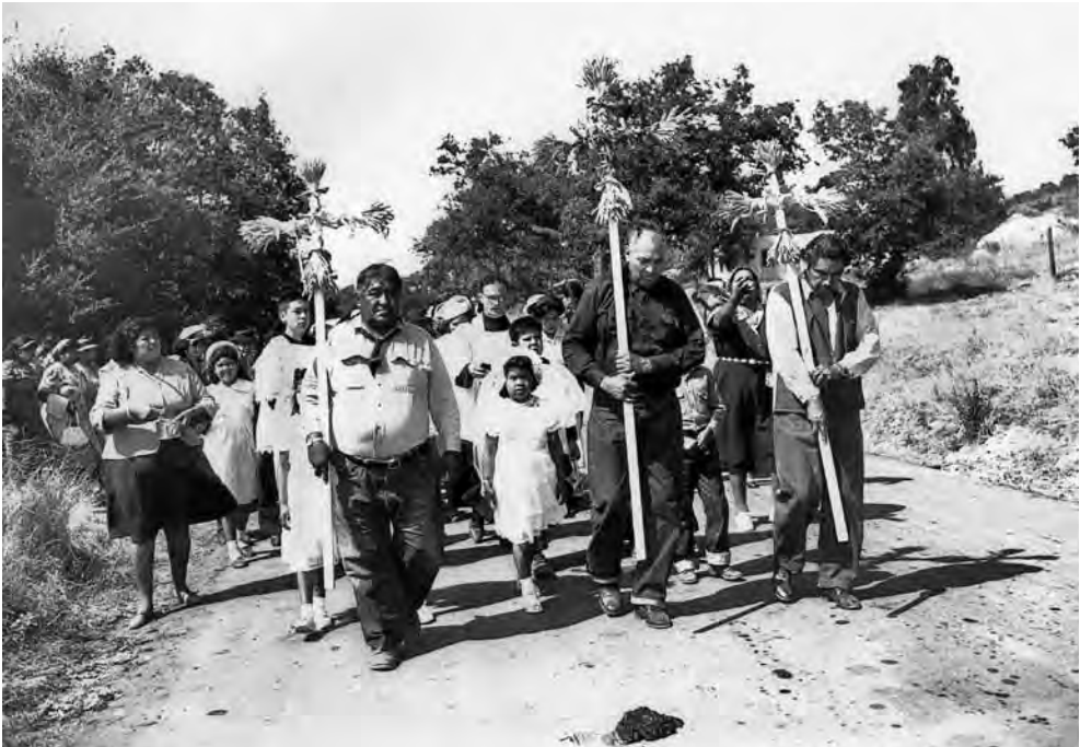
The Blessing of the Cross Festival at the Barona Indian Reservation, August 15, 1952. ©SDHC, Union-Tribune Collection, UT #8248-232.

official commitment to the same. The new home of the Capitan Grande Indians at Viejas did not provide its population with economic self-sufficiency or even measurable improvement in their standard of living until the advent of Indian gaming in California in the 1980s. 78 Because they had relocated as a group to federal trust land after a hard-won struggle in the 1930s, the Viejas people capitalized on their quasi-sovereign status and limited immunity to state law, just as the Baronas did. Invaluable water rights to the San Diego River were lost, but the large Capitan Grande reservation—an anomalous reservation without Indians—continues to be owned collectively by the Barona and Viejas people as “successors in interest.” El Capitan stands as a mute witness to an important, but little known, episode in San Diego history.