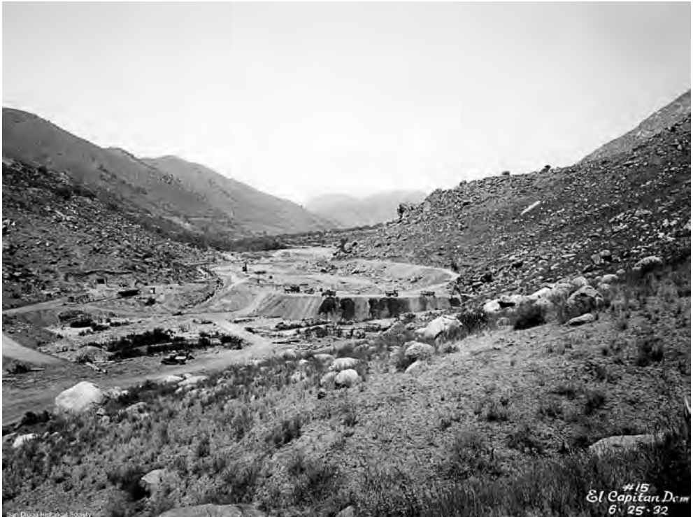
El Capitan Dam under construction, June 25, 1932. ©SDHC #4334-A-15.