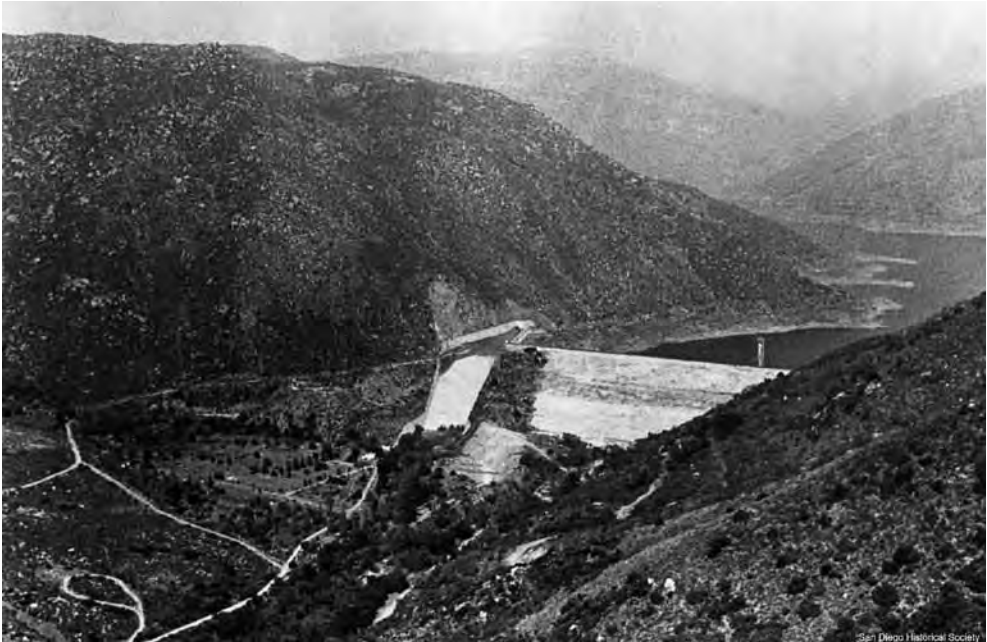
El Capitan Dam, June 1955.

The BIA and the City of San Diego sought, first, to move the Paipa group and their graveyard from the flood zone, preferably without the use of force; and, second, to persuade the Conejos group to move away from Capitan Grande voluntarily, preferably as individual family groups severing their tribal ties. Federal bureaucrats, enmeshed in the social-engineering mentality of the age, assumed that the superior planning by intelligent, professional experts would neutralize the Federation's influence. "Whether [the Paipa group] will move before it becomes