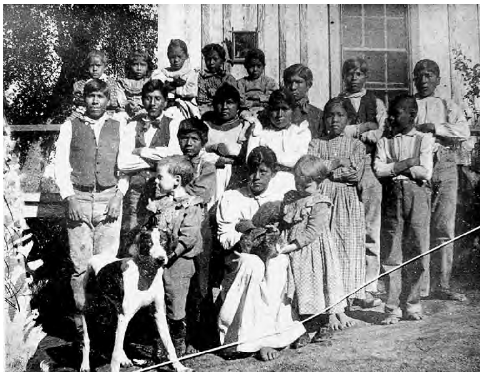
Capitan Grande School children around 1905.