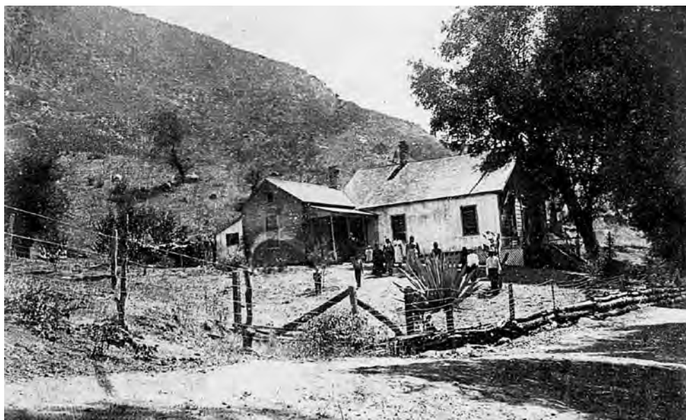
Schoolhouse at Capitan Grande, ca. 1900-10.

potentially involved millions of dollars. One federal employee publicly accused Willis of collecting $88,000 from the Mission Indians to enrich himself. The Baron Long's ranch purchase was now a strategic asset in a larger struggle in which the stakes were large. 34