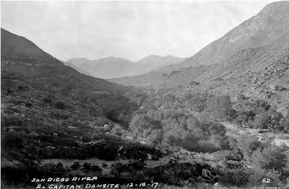
El Capitan Dam site on the San Diego River, December 16, 1917.