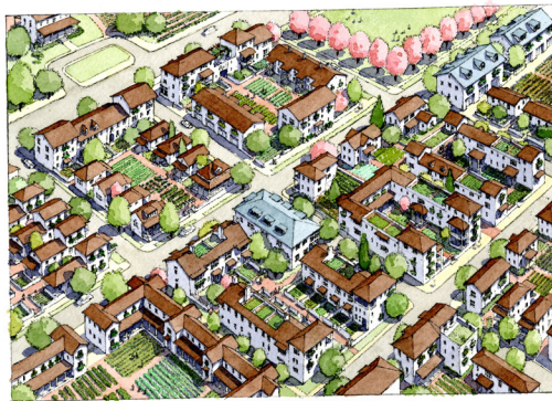
Figure 2. Southlands, Canada as an example of agrarian urbanism.

As the world urbanizes, the relationship of humans to nature does not have to—in fact, it must not—diminish (Beatley 2011, 152). Agrarian values must not be secluded in the spatial and temporal backcountry (2011, 8). Insurgent planning in the form of urban agriculture demands the right to an intimate connection with the land. Planners can respond by integrating nature—and specifically agriculture—into the built landscape. Although models for denser built environments address various social, environmental, and health problems, they are not enriched with agrarian values and biophilic design. There are models from around the world for integrating natural features of various scales and agriculture into the city fabric; and there is