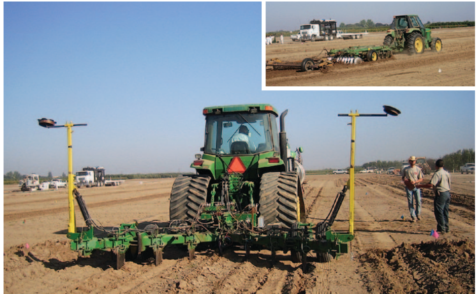
Shank application of 1,3-D is followed by a disking/rolling operation, inset , to break the shank trace and compacted soil surface.

Soil fumigation with methyl bromide has been used for decades in California to control a variety of soil-borne agricultural pests, such as nematodes, diseases and weeds. Major, high-value cash crops that rely on soil fumigation include strawberries; some vegetables such as carrot, pepper and tomato; and nurseries and orchards for stone fruit, ornamentals and grapevines. In California, tree and grapevine field nurseries must meet requirements of the California Department of Food and Agriculture (CDFA) Nursery Nematode