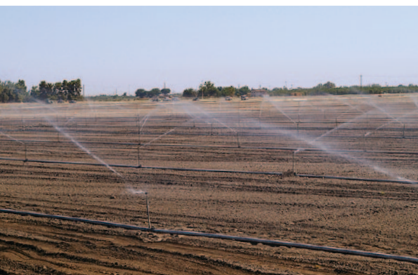
Irrigation with sprinklers forms a water seal, which minimizes emissions after fumigation.

Cost is important when evaluating the feasibility of emission-reduction