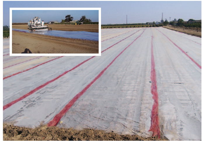
A company applies fumigant through drip irrigation in a strawberry field.