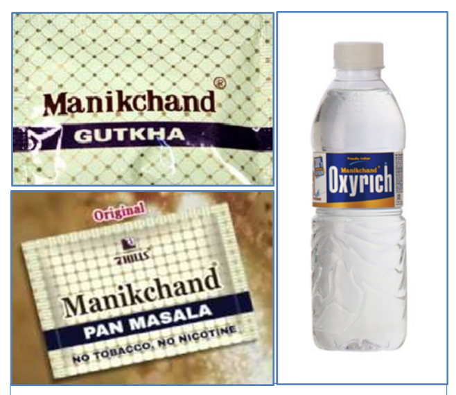
Figure 1. Manikchand producing gutkha, pan masala and water bottle could advertise its water bottle but not pan masala, all with the Manikchand brand.

suitable for unrestricted public exhibition prior to telecast or transmission or retransmission. For example, Manikchand, one of the biggest smokeless tobacco manufacturers in India, at that time sold gutkha (with tobacco), pan masala (without tobacco) and drinking water under the same brand name "Manikchand." The presentation, colour, design of the pan masala product was similar to that of the gutkha so it could not advertise its pan masala brand but the water bottles used different colour and design and thus could be advertised. (Figure 1).<sup>57</sup> The MoIB told Parliament that it set up state and district level monitoring committees (with the District Magistrate as its chairman) to monitor violations by the private cable and satellite TV channels and investigate specific complaints regarding violation of the Program Code and Advertising Code under