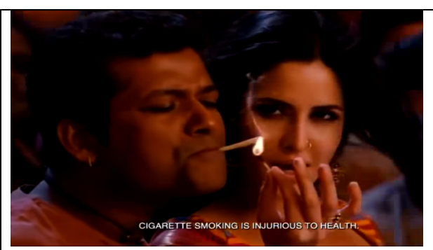
Still from the film Agnipath (2012, Dharma Productions)

argued was adequate to prevent ill-effects of tobacco use. He contended that the anti-tobacco health warning as a prominent static message at the bottom of the screen during the display of the tobacco would unnecessarily disturb the viewers' attention and prevent enjoyment of the movie as a piece of art.<sup>212, 213</sup> The High Court, following the July 2013 direction of the Supreme Court, <sup>125</sup> refused to grant a stay. <sup>136</sup>