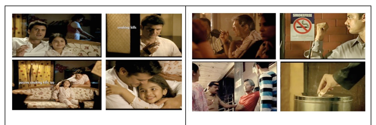
Figure 5. Two new anti-tobacco advertisements released by the MohFW on 30 September 2013. Child (left)<sup>214</sup> showed a father smoking at home with the daughter starting to cough to illustrate the ill-effects of secondhand smoke. The father puts out his cigarette. Dhuan (right)<sup>215</sup> is a message about smoke all around the city and the ban on smoking in public places. The message is to put out your cigarette or it will subject you to a fine.