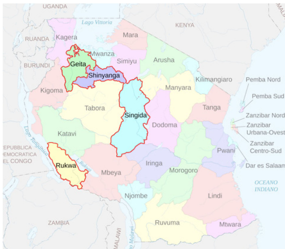
Fig. 1 Intervention regions. Study conducted in 2 districts in each of the 4 regions

This project component addressed challenges around prompt management of OH and around OH referral between facilities through the introduction of the NASG (LifeWrap-NASG, Hong Kong) along with a Closed User Group (CUG) mobile phone network for public dispensaries, health centers, and three public referral hospitals, as well as three private referral hospitals in the eight districts of Geita, Nyang'hwale, Kalambo, Sumbawanga, Singida, Ikungi, Shinyanga, and Kahama (Fig. 1 for a map of the regions). A total of 280 facilities were enrolled: 17 Comprehensive Emergency Obstetric Care (CEmOC) facilities and 263 Basic Emergency Obstetric Care (BEmOC) facilities (17 health centers and 246 dispensaries). To qualify as a CEmOC referral facility, a site needed to have an operating theater and the capacity to perform a blood transfusion. BEmOC level health centers served a population of 50,000 people and provide inpatient care. Dispensaries provided the lowest level of care, serving a population of 10,000 people, and offering delivery beds and outpatient services. While dispensaries were intended to provide BEmOC care, not every dispensary was completely able to do so (the majority were