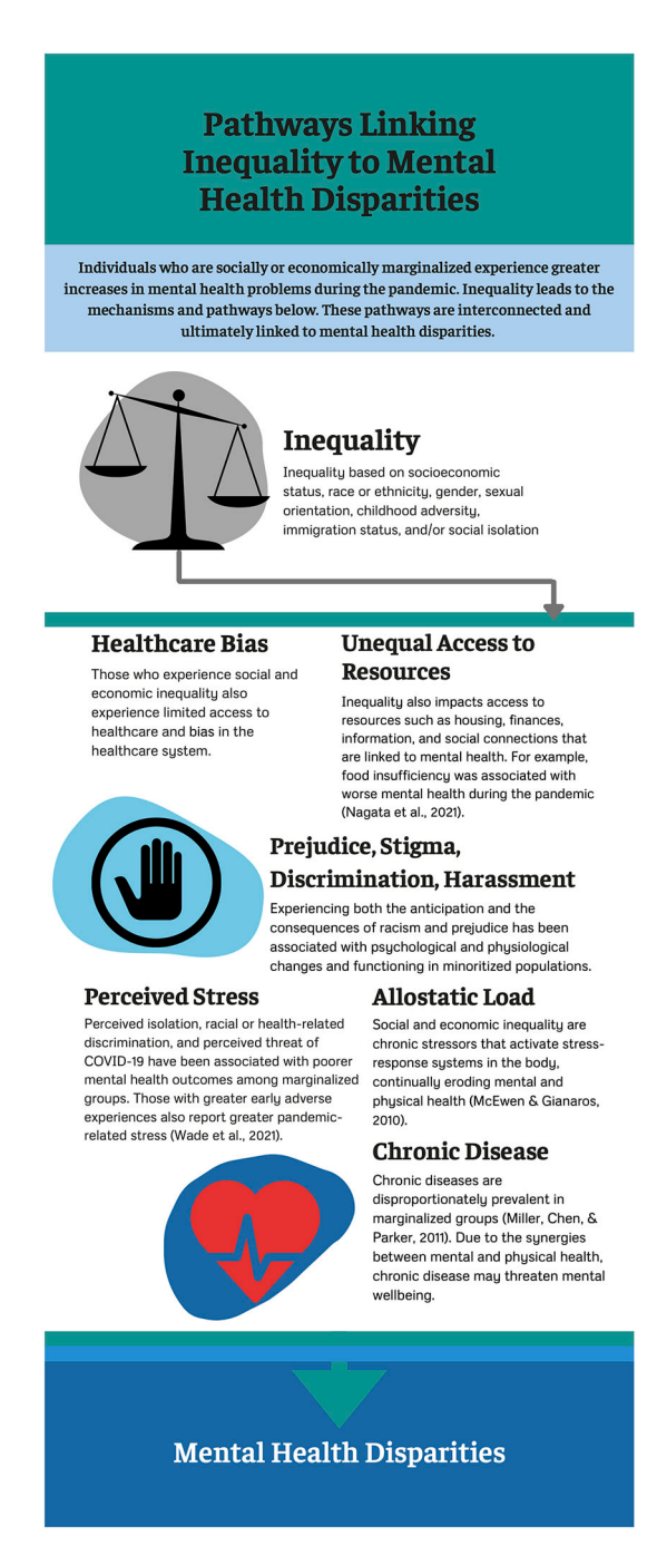
Figure 1. Infographic on mechanisms and pathways linking social and economic inequality to mental health disparities surveyed in this review.