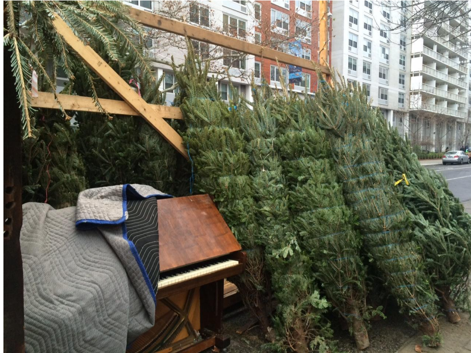
Fig. 8. Stand in Soho. Fir trees lean against a wooden fence and a piano found by the seller on a sidewalk, December 2015.

If New York City witnesses the apparition of fir tree forests, it also witnesses the sudden appearance of constructions near the fir tree forests. Usually the sellers arrive at the location before any trees are dropped off. The experienced sellers come with their tools and hunt the city sidewalk for any furniture. The stands of French Canadians in particular have constructions of a shed or cabin made from scratch. Knowing that they need to spend twelve hours a day, tree sellers makes the stand as cozy as possible (Figures 9 and 10).