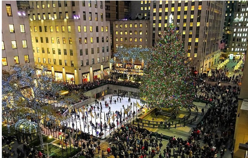
Fig. 4. Christmas at Rockefeller Center.

somewhere in the United States—the largest tree to date was from Killingworth, Connecticut, that measured 100 feet tall. Every year the tree gathers thousands of tourists and New Yorkers who share an urban holiday experience together. The annual tree lighting, aired on NBC nationally every year, has become an event where famous singers perform Christmas songs when the tree is lit up for the first time. This Christmas ritual launches New York City residents into the holiday festivities (Figure 4).