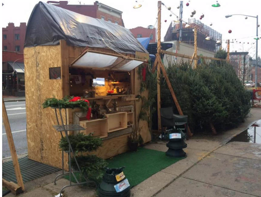
Fig. 2. Stand in Greenwich Village. Shed built by two female French-Canadian sellers with bought materials and found objects for the interior, December 2015.