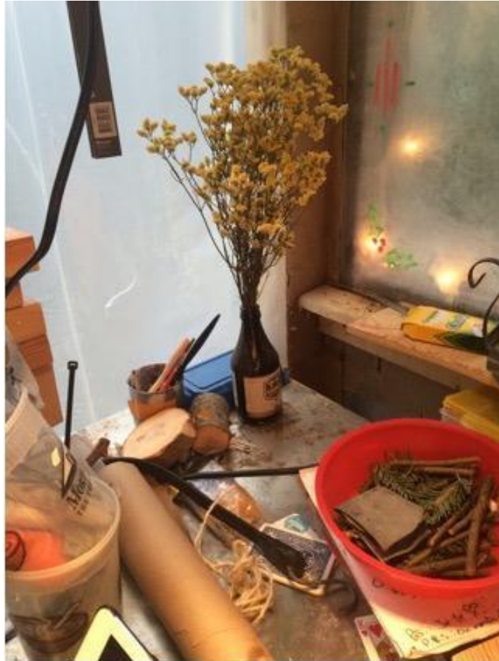
Fig. 10. Inside the shed, December 2015.

Some spend a day or two creating stands for the trees, places to stock decorations, and even sometimes a place to sleep near the trees. Many of them start from scratch and build a stand out of materials that they buy. They add Christmas lights and other festive decorations to draw the attention of potential customers. Many scout the city for artefacts to make their stand look different and attractive.