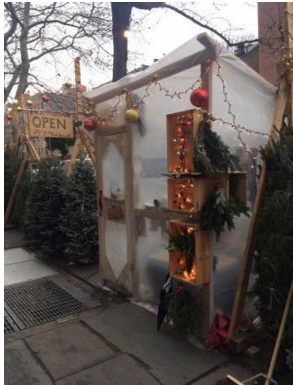
Fig. 3. Stand in the West Village. Shed built with bought materials by a couple from British Columbia Canada, December 2015.