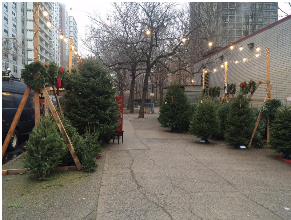
Fig. 1: Stand in Soho. Fir trees of different height standing along the sidewalk, December 2015.

This paper investigates a particular case of the use of New York's public spaces: Christmas tree sellers. We report the results of this study on this group to uncover competing agendas of the users of public spaces and the city officials who control them. This paper addresses the practices of the power of negotiation of public spaces by urban actors, how they interpret, use, and enforce public space in the government-owned infrastructures of New York City sidewalks (Figure 1).