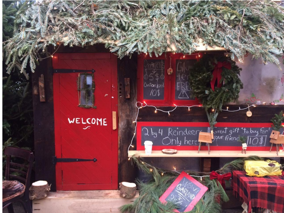
Fig. 6. Stand in Soho. An elaborated cabin built from found objects in the city, December 2015.

From an outsider's perspective, a Christmas seller stand looks like a mom and pop shop. The people look at the stand as if these sellers brought their fir trees from their farm to sell in the streets of New York City. This false impression also gives the customer an illusion of an egalitarian relationship among sellers. This naïve image of a family run business may be true for a small number of stands. Nonetheless, all stands do not have the same values and are not equal in their positions. New York City sidewalks belong to the highest bidder for a month. The competitive relationships are very much vertical either among the workers within each business or between stands (Figure 7).