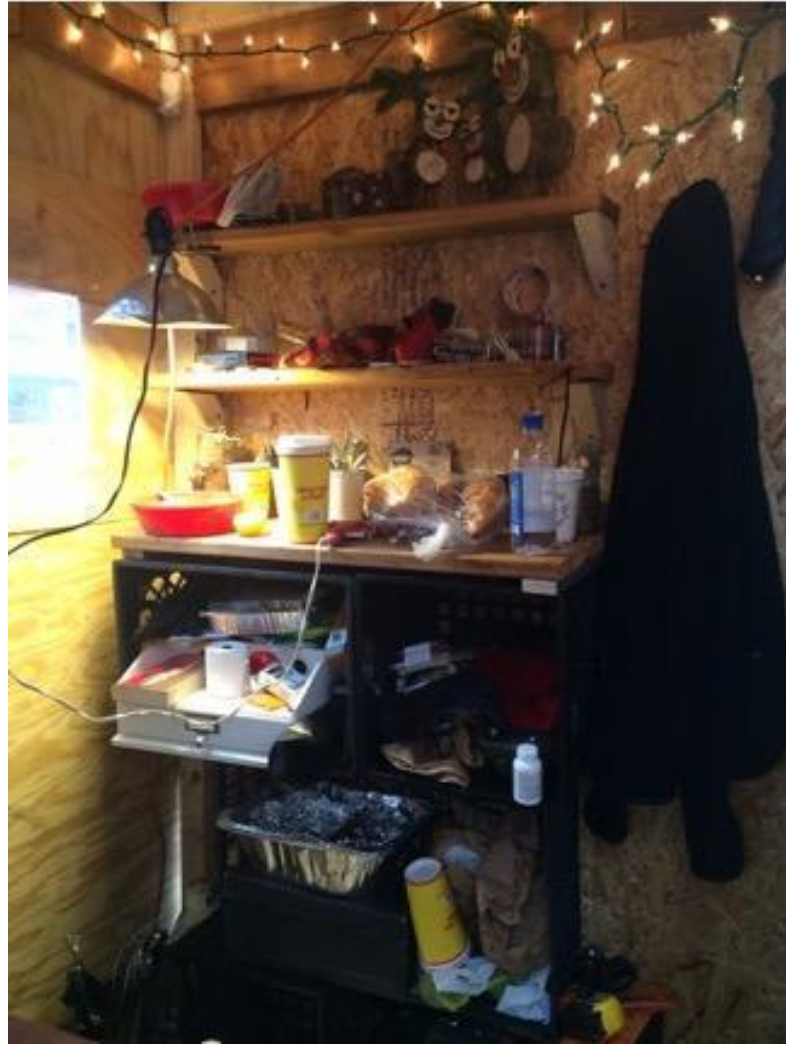
Fig. 9. Inside the shed, December 2015.