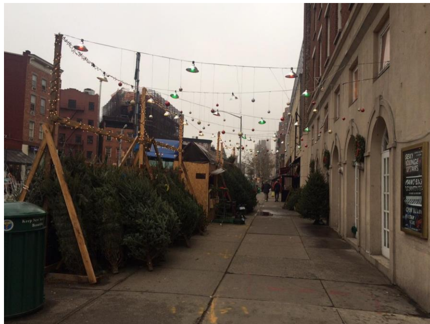
Fig. 5. Stand in the West Village. Fir trees lean against a wooden fence with lights and ornaments hovering over the sidewalk, December 2015.

On average, a tree stand in Manhattan makes about $30,000 a season, whereas the seller only makes a fraction of that (DNAinfo Staff). The location of the stand has an impact on how well or how badly the business will do throughout the month of December (Figure 5). The more crowded neighborhoods tend to have more than one stand within the area, which brings competition into play. When the price of the rent for tree stands goes up, the price of the trees also goes up every year. "For the most expensive spot, a tree-stand at SoHo Park on Sixth Avenue and Spring Street, competitive bidding pushed the rent up 19 percent, from $47,000 to $56,005, according to official city statistics" (Messing, Rosario & Golding). Similarly, "Figures from the city Parks and Recreation Department show that it is raking in $238,665 on tree-selling leases at 21 public places in Manhattan, Brooklyn and Queens from Nov. 23 through Dec. 27" (Messing, Rosario & Golding). The intense bidding process has had a toll on many of the Christmas tree owners and even New Yorkers who cannot afford trees because of price increases. In many of the businesses, customers were essentially paying per foot for their tree. This means that if the standard is $30-$40 per foot, they would pay about $180 a six-foot tree.