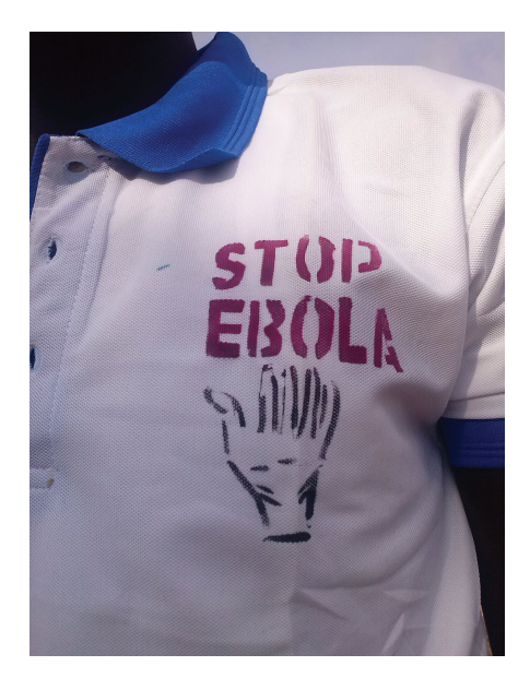
FIGURE 4. Baghdad Staff to Stop Ebola.