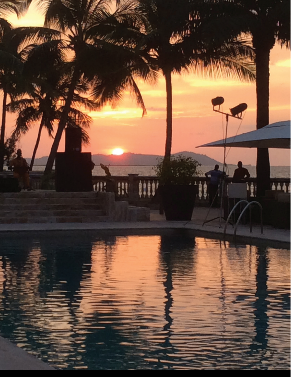
FIGURE 1. Pool of the Palm Camayenne, Conakry.