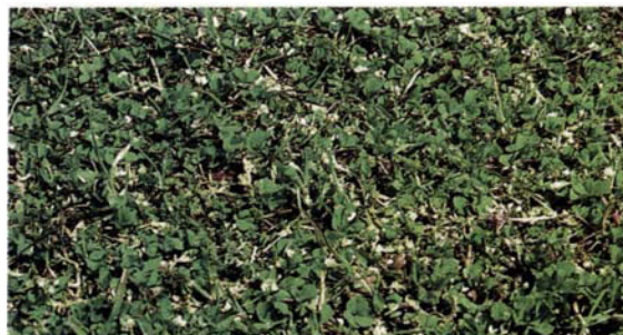
Several subclovers provided excellent cover on dryland pastures after several years. The authors recommend seeding with a mixture of high-performing varieties to optimize forage for livestock.

The climate at the HREC is Mediterranean with hot, dry summers and mild, rainy winters. Rainfall records for the trial period show that the long-term results of the annual legume persistence trials were not affected by unusually wet or dry periods. The 10-year average annual rainfall (measured from July 1 to June 30) over the trial period was 39.88 inches, slightly higher than the long-term annual rainfall for the station of 37 inches (fig. 1). Rainfall was less than average for five of the years, and the 1993–1994 season