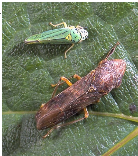
Vectors of Pierce's disease include the blue-green sharpshooter ( Graphocephala atropunctata ), top, and the nonnative glassy-winged sharpshooter ( Homalodisca vitripennis ), bottom.