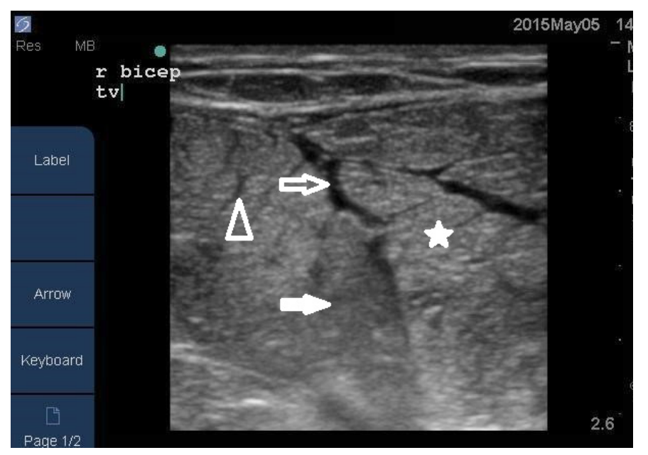
Figure 1. Transverse image of rhabdomyolysis of the right biceps muscles using a linear array transducer. Areas of increased and decreased echogenicity are seen, as well as disorganized muscle fibers within surroundings areas of fluid. The arrowhead is pointing towards the disorganized muscle fibers. The open arrow is pointing to areas of fluid. The closed arrow is pointing to areas of decreased echogenicity. The star is indicating the areas of hyperechogenicity.