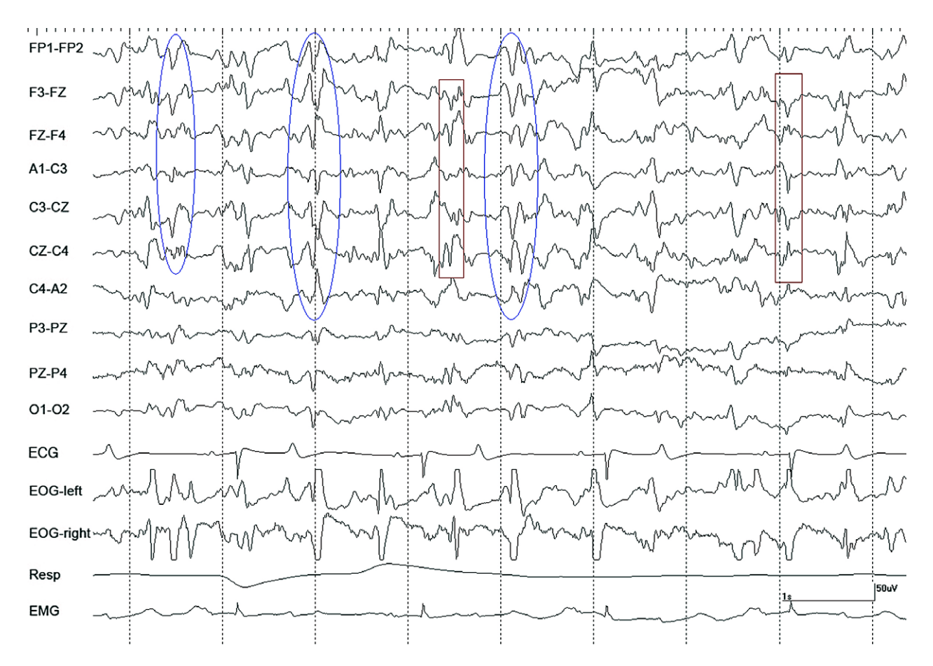
Fig 1. Sharp waves (blue ovals) and spikes (red boxes) in an epoch from horse #2 during isoflurane anesthesia at 1.6 times minimum alveolar concentration with controlled ventilation. Similar discharges are often recorded from epileptic patients. Note: These events were also recorded by the electrooculogram (EOG) channels below. Gain calibration is shown for electroencephalography and EOG tracings only, others vary. The squaring off of some events denotes they are outside the dynamic range of the amplifiers.

Recording duration is a factor in obtaining diagnostic EEG from human epilepsy patients. Even for a recording with a minimum duration of 30 minutes, including hyperventilation and photic stimulation (2 activation techniques used to increase the diagnostic yield [chance of obtaining epileptiform discharges in the EEG]), the odds are roughly 50% that abnormalities will be detected. These odds increase to 85% if a period of