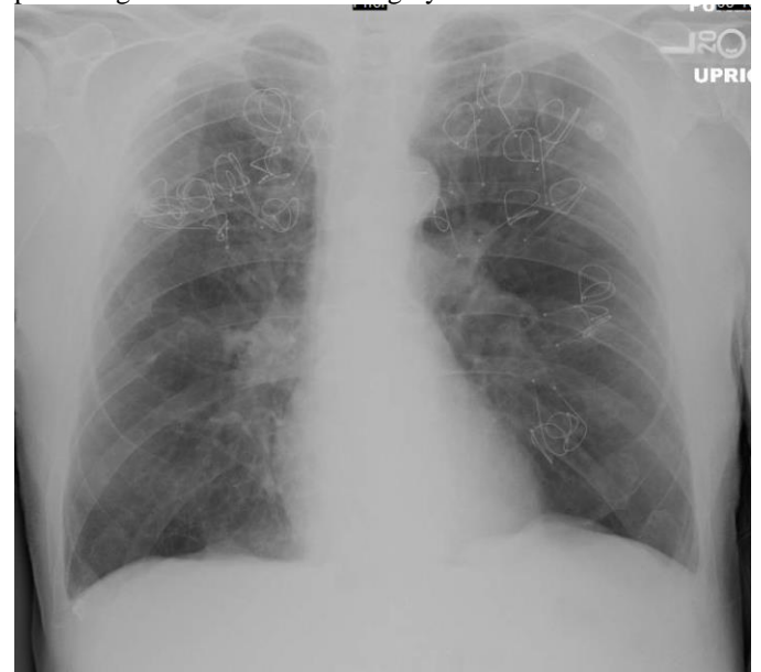
Image 1. Chest xray demonstrating bilateral emphysematous changes with numerous coils throughout the lungs related to prior lung volume reduction surgery.