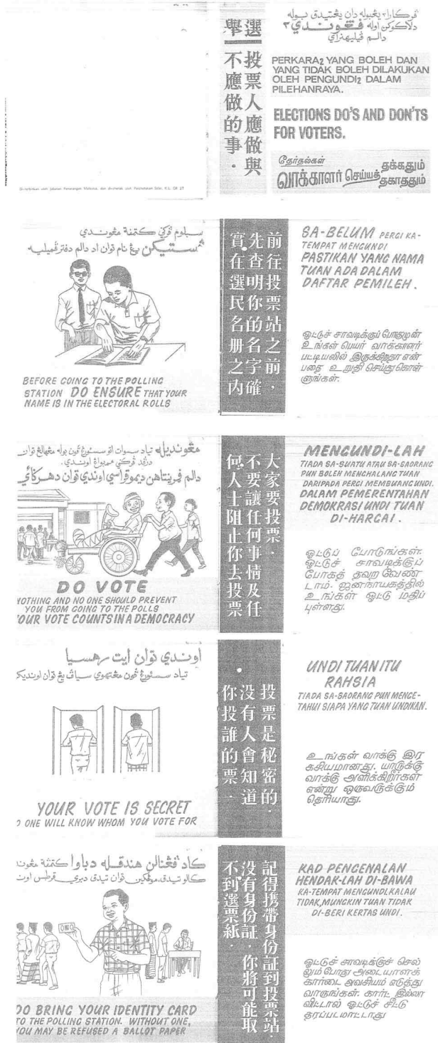
Figure 5.1 Selected pages from the booklet “Elections Do’s and Don’ts for Voters”