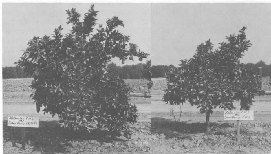
FIGURE 2. Trees of Valencia orange on sour orange rootstock. Left. Healthy Valencia bud propagated on a sour orange seedling inoculated 10 months previously with recovery SYT virus (isolate R 1 SY4). Tree is in normal condition after 3½ years in field. Right. Naturally infected control. This tree developed tristeza symptoms after 2 years in field, apparently from a mild strain of virus, which has permitted the tree to reach an equilibrium stage of tristeza.

Inasmuch as the trees of sweet on sour orange rootstocks infected with R 1 SY4 virus have not developed tristeza symptoms up to their present