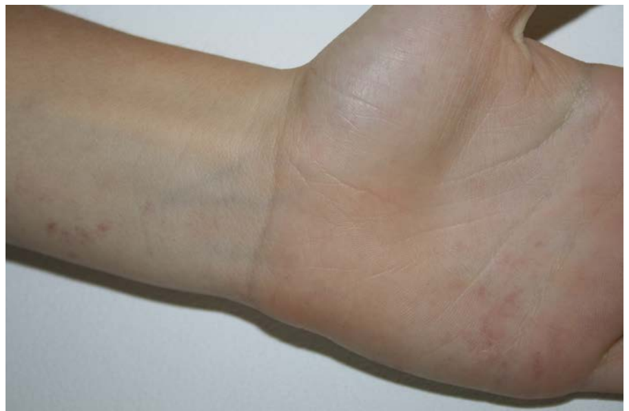
Figure 1. Angioma serpiginosum. Clinical image. Erythematous punctate papules on the palm and the inner aspect of right hand and forearm.

Dermoscopy showed an erythematous parallel ridge pattern with some red globules and dots spreading in a linear arrangement; acrosyringial openings were not affected (Figure 2).