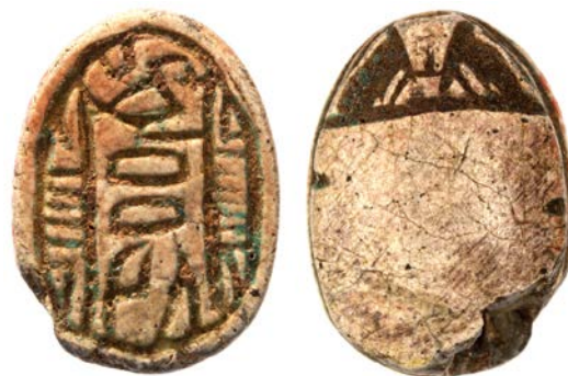
Figure 1. Scarab of a Lower Egyptian king Maaibra Sheshi found in a Dynasty 18 context in Deir el-Bahri. One of the hundreds of seals and impressions bearing the name of this king, unattested in other sources.

names of kings, attested mainly by scarabs (fig. 1), are believed to be of northwest Semitic origin; earlier propositions that they could have been of Hurrian origin have been rejected (Schneider 1998). The emergence of original forms of ceramic ware at Tell el-Dabaa with no exact parallels in Egypt or in the Levant in stratigraphic phase F is seen in scholarly literature as a sign of cutting ties with Egyptian central power (Bader 2009: 705; Kopetzky 2010: 270-271). Avaris was actively expanding since becoming the capital of a kingdom, and the size it reached in late Second Intermediate Period allowed Manfred Bietak (2010b: 13) to call it the largest known city in Egypt and the eastern Mediterranean of that time.