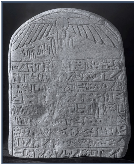
Figure 4. Stela of an Egyptian officer loyal to the ruler of Kush.

being an autobiographical statement of an official, mentioning the ruler's name ndh (Philadelphia E.10984, fig. 4, and Khartoum 18; Kubisch 2008: 166-171). The same title is used in a letter claimed by Kamose to have been sent by Apep to his Nubian ally, whereas the composer of the Kamose stelae designated the Nubian adversary as the "chief of Kush" ( wr n kš ; Kubisch 2008: 87). An anepigraphic stela found in Buhen (fig. 5) is often considered to depict a ruler of Kush wearing the Upper Egyptian crown (Smith 1976: 11-12 [691]; contra Knoblauch 2012). Vivian Davies interprets the name tr-r-h , which was inscribed at the entrance of a cave in the Nubian Eastern Desert with a lion determinative and coincides with the name of a ruler of Kush who is known from a Dynasty 12 execration text, as the name of a Second Intermediate Period ruler of Kush (Davies 2014: 35-36). Given the Dynasty 12 date of the parallel, this inscription could, however, also antedate the period in question.