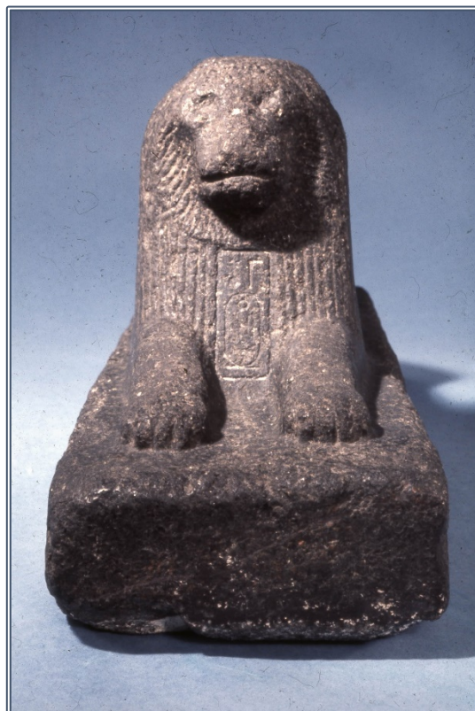
Figure 2. A lion statue inscribed with the name of the king of Avaris Khian.

limestone architrave from the north is unclear, and no comparable objects are known to have been hauled away during the Second Intermediate Period. The kingdom of Avaris maintained a vast network of trade connections across the Mediterranean and the Near East. In early historiography, specimens of the material culture and inscribed objects found outside Egypt, such as the lion statue of Khian from Baghdad (fig. 2), were considered possible evidence for the power of Avaris kings stretching as far east as Mesopotamia (Meyer 1909: 295-296); however, such interpretations have long been abandoned.