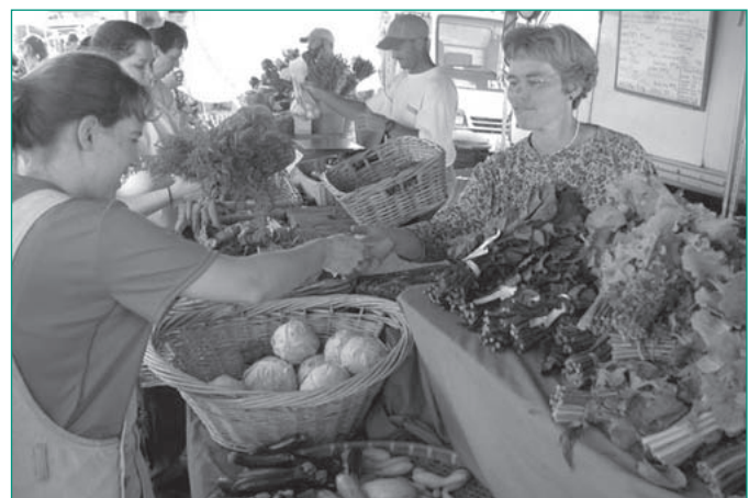
Social issues research at the Center includes studies of the ways that consumers perceive of social issues in the food system, including such issues as workers’ rights and salaries, and the value of small-scale agriculture.