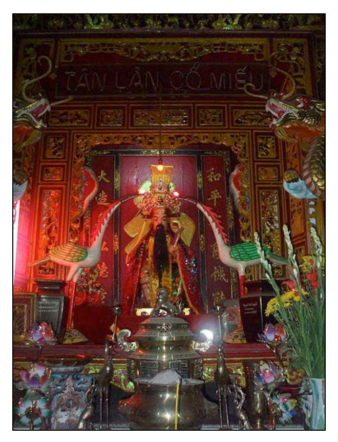
Figure 4. Chen Shangchuan, a deified hero in southern Vietnam.

and pirate, today is a popular deified hero in southern Vietnam as the founder of Biên Hòa, outside modern Ho Chi Minh City (see figure 4). Originally, Chen hailed from a family of merchants who lived on one of the many islands located in the northern corner of Guangzhou Bay in Wuchuan County in southwestern Guangdong. His family had moved there from Fujian several generations earlier. During the turmoil of the Ming-Qing transition, Chen joined the Ming loyalist cause under the Yongli Emperor. He soon became associated with Deng Yao and other pirate-rebels on Longmen Island. After his defeat in 1682, Chen, together with Yang Yandi and others, fled to southern Vietnam around Saigon with several thousand followers (Xu and Xie 2000, 3, 25; Li 2010, 276–277).