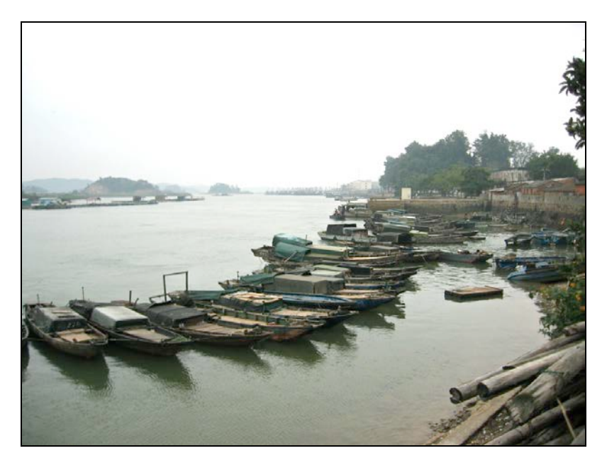
Figure 5. Fishing boats anchored in Longmen harbor, 2010.