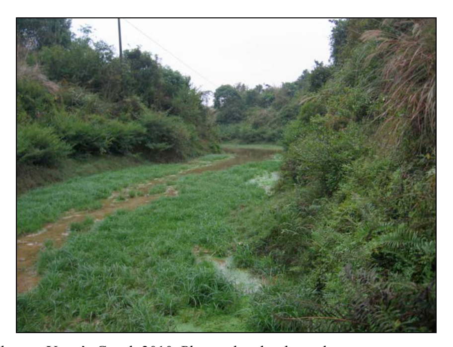
Figure 7. Righteous Yang's Canal, 2010.

so the story goes, he built an altar at the highest point in or near his citadel, where he earnestly prayed to the Jade Emperor, the Sea Dragon King, and the Gods of the Mountains and Earth (in other stories, he prayed to Heaven) for help in building an escape route. Seeing that Yang fought a righteous cause—that is, that he fought against the alien Manchu invaders—the gods took pity on him and at night sent forth an army of celestial soldiers ( tianbing ) to dig out a canal and then brought forth a heavy rain, which allowed Yang and his men to escape to sea.<sup>14</sup>