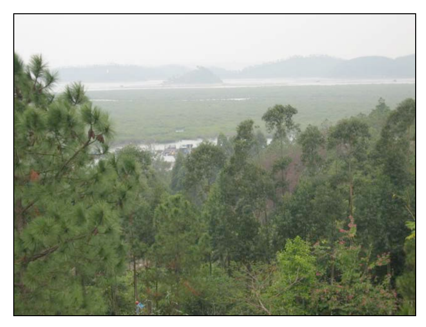
Figure 3. The Seventy-Two Passages, 2010.

Qing scholar Pan Dingqui, in his Travel Record of Annam (Annan jiyou) , published in 1689, Longmen was the "outer door" to Qinzhou, strategically located between Guangdong and Vietnam. Pan describes the area, with its many islands, lagoons, and mangrove swamps, as an imposing "sea frontier" and veritable "refuge for pirates" (Pan [1689] 1985, 3–4). A huge mangrove swamp, called the "Seventy-Two Passages" ( Qishier jing ) because of its intricate waterways and dense vegetation, had a deserved reputation as a retreat for pirates and smugglers since at least the Song Dynasty (see, for example, Zhou 1178) (figure 3). From there, ships could easily and clandestinely sail eastward toward Hepu and Leizhou, or westward toward northern Vietnam; in either direction the journey took about one day. In the late seventeenth century, Longmen in fact became the one of the most important centers for anti-Qing resistance in southwestern China (Pan [1689] 1985, 3–4; Qin zhouzhi 2009, 37; Li 2010, 271–272; author's fieldnotes from Qinzhou, January 2010).