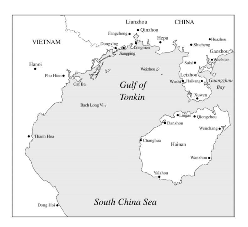
Figure 1. Gulf of Tonkin, seventeenth century. Map prepared by the author.

The years from 1644 to 1684 were times of chaos and anarchy in China and Vietnam. The Sino-Vietnamese water frontier became a haven for pirates, dissidents, and refugees; it was also an area where heroes were born (see figure 1). Piracy, in its multiple forms, was in fact a persistent and intrinsic feature of this water frontier and a dynamic and important force that helped to shape the region's history and development.