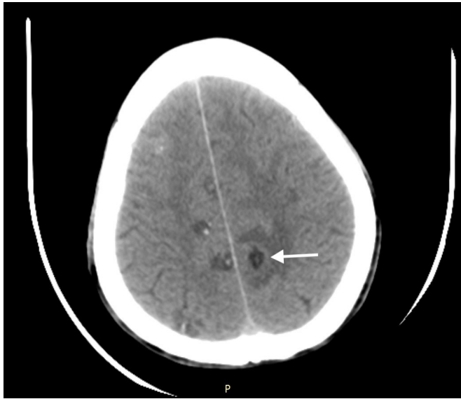
Image 3. Computed tomography of the brain showing multiple cystic lesions in vesicular and colloid-vesicular stage with lesion in left cerebral hemisphere demonstrating surrounding edema (arrow).

in the spinal cord. The scolex is visualized as a bright, extramural nodule within the cyst (hole with dot appearance). Parenchymal NCC has four stages: vesicular; colloidal vesicular; granular nodular; and nodular calcified. When multiple cysts in different stages of evolution are visible it gives rise to the “starry-sky” appearance, which is typical of NCC.