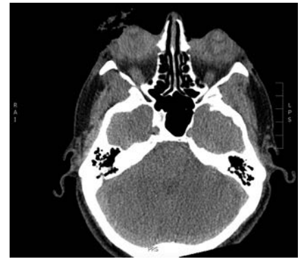
Figure 2. Axial computed tomography scan of the orbits without contrast showing small, irregular globes anteriorly displaced. There is bilateral intraocular hemorrhage and disorganization of the intraocular contents.

Cases of attempted and completed self-enucleation are rare, but require comprehensive care and interdisciplinary management between teams in emergency medicine, internal medicine, psychiatry, and ophthalmology. Our case contributes to the literature by reporting a more uncommon situation of self-enucleation attempted by a previously high-functioning patient who developed an episode of bipolar mania and acute psychosis. Furthermore, our patient became psychotic even in the setting of