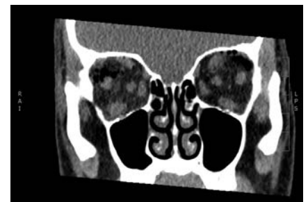
Figure 3. Coronal computed tomography scan of the orbits without contrast showing multiple foci of air and trace fat stranding within the extraconal and intraconal orbits bilaterally.