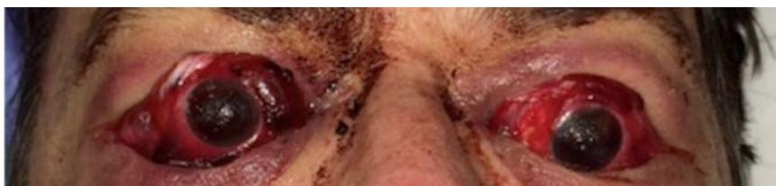
Figure 1. Appearance on presentation after attempted bilateral self-enucleation. The globes have been pulled anteriorly and display significant conjunctival lacerations and hemorrhage. Due to the anterior displacement there is severe exposure keratopathy with poor eyelid coverage of the corneas bilaterally. The superior rectus muscle is exposed and dehisced from its attachment in the right eye.

Attempted self-enucleation is important to diagnose and manage as it can have both devastating ophthalmologic consequences. One of the most dreaded complications is complete visual loss, such as in this patient we report. Management requires assessment for visual potential, closure of wounds, and limitation of ophthalmic exposure in cases of severe proptosis. Orbital inflammation and edema can be controlled with intravenous corticosteroids if there is