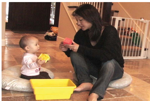
FIGURE 4 Example of infant and mother in free play interaction at 12 months, from which maternal speech counts were derived. (Color figure available online.)

Maternal Speech. To assess and control for possible caregiver effects on vocabulary, (i.e., quantity and diversity of lexical input), maternal language to infants during a play session was transcribed. During the visit to the dyad's home when the infants were 12 months old, infants and mothers engaged in approximately 12 minutes of unscripted ("free") play. Dyads were video-recorded while playing on the floor with a set of infant toys provided by the experimenter (Figure 4). Thus, objects that served as potential referents of maternal speech were controlled across dyads. Maternal speech was transcribed off-line using ELAN software ( http://www.lamp.eu/tools/elan/ ; Sloetjes & Wittenburg, 2008).