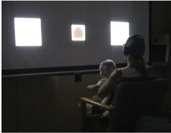
FIGURE 1 Infant sitting on mother's lap, viewing the three image locations, with a center cue displayed. (Color figure available online.)

camera captured the infant's face. Another experimenter (E2) in an adjacent control room monitored the infant's face, and began the program to present stimuli and record infants' responses.