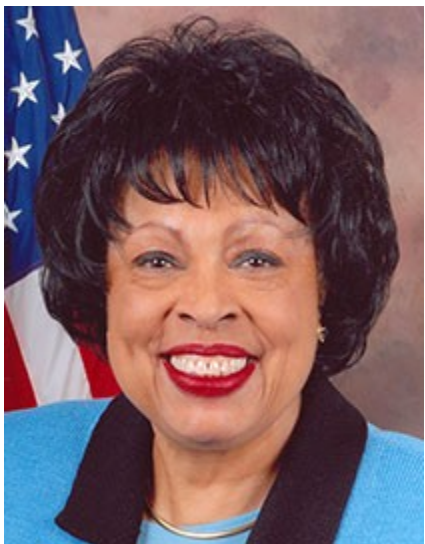
Diane Watson