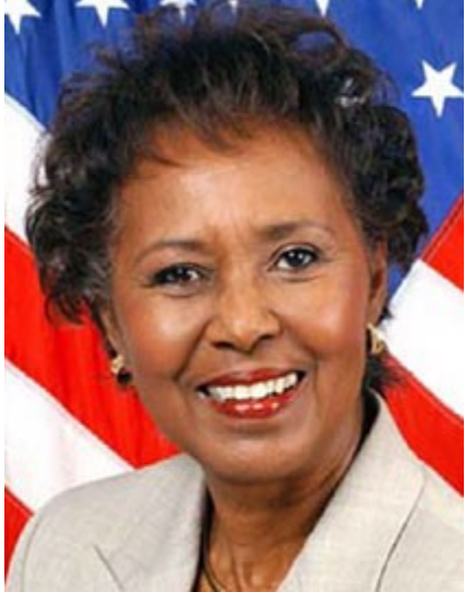
Yvonne Brathwaite Burke

Over the next half-century, only 10 other women were elected to the California Legislature. Not until 1976 was a woman elected to the state Senate. U.S. Rep. Barbara Lee (D-Oakland) noted that it took decades for Black women to be elected to the Legislature — and added that, as a Berkeley alumna, she is “proud” that two other UC graduates again played historic roles.